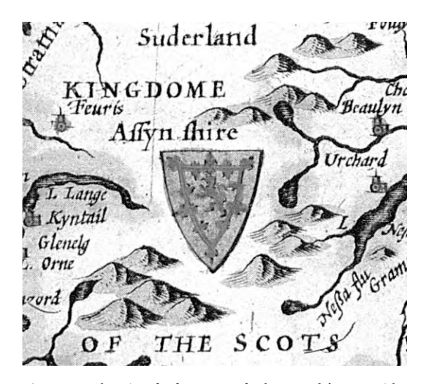
Fig. 18.17. Close in of a fragment of John Speede's map with the legend saying "Kingdome of the Scots". Taken from [1160], page 167.