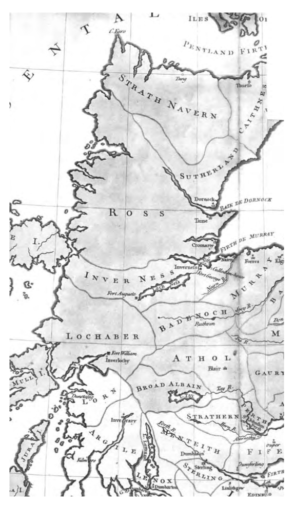
Fig. 18.18. Map of Scotland dating from 1755 with a large area called Ross – possibly, the Russian area. Taken from [1018].