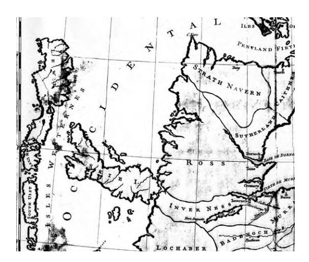
Fig. 18.20. Map of Scotland dating from 1755. Part one. Taken from [1018].