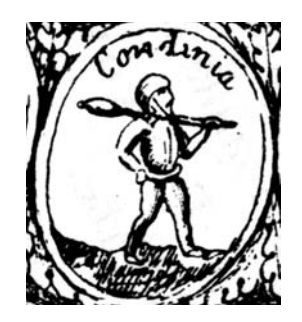
Fig. 14.99. Coat of arms of the Kingdom of Candia (England or the Isle of Crete) on the State Seal of the Russian Empire. Taken from [162], page XI.

Let us briefly quote an encyclopaedia entry on Kent: "Canterbury is a town in the South-East of England (County Kent) ... After the Anglo-Saxon conquest of Britain the city became capital of the Kentish Kingdom. At the