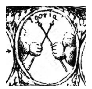
Fig. 14.86. Coat of arms of Yougoria (Hungary) on the State Seal of the Russian Empire. Taken from [162], page XI.