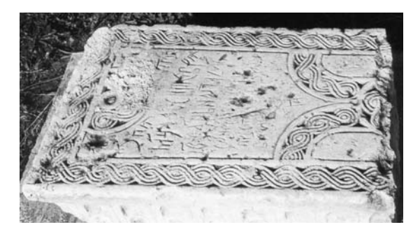
Fig. 14.53. Lettering on an old headstone, presumably dating from the XVI century. Photograph of 2000, taken in the Louzhetskiy Monastery of Mozhaysk.

ing of the letters, tried to use lines of different thickness, which made the lettering look more dynamic. The same technique was used in the artwork of the forked cross and the perimeter ornament. Also, the inscriptions of the Romanovian epoch always fit into the place between the two top lines of the cross and the perimeter artwork. The space of this field would differ from headstone to headstone; this would be achieved via different angles of the cross lines and different locations of its centre. It is perfectly obvious that the craftsmen would always know the size of the space they needed for the epitaph and arrange the artwork accordingly.