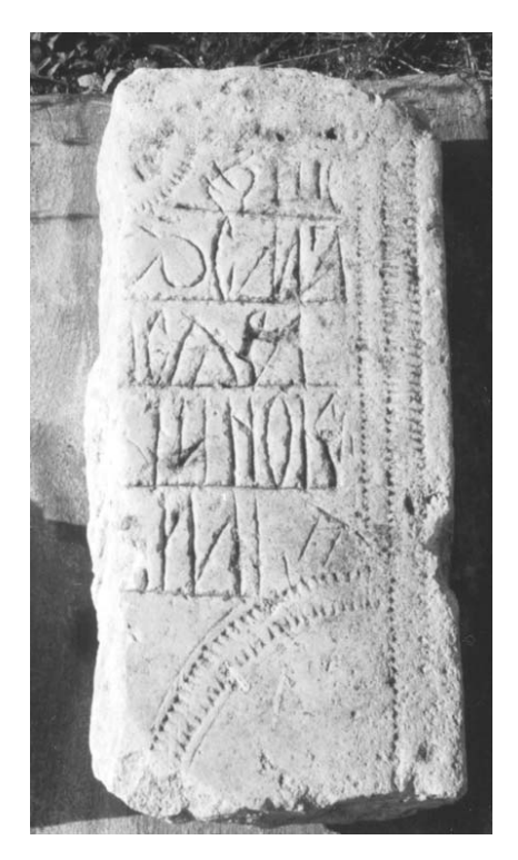
Fig. 14.49. Explicitly counterfeit lettering on a headstone with a forked cross. In the top right we see a scratched date – presumably, a XVI century one (the letters stand for the 7050's or the 7080's; one needs to subtract 5508 to end up with a modern dating falling over the middle or the end of the XVI century. One sees the crude guiding lines – however, they didn't make the letters any less clumsy. The ornaments look older than the lettering – time has almost obliterated them. Nevertheless, it is obvious that, unlike the lettering, the ornaments were carved by a professional. Photograph of 2000, taken in the Louzhetskiy Monastery of Mozhaysk.