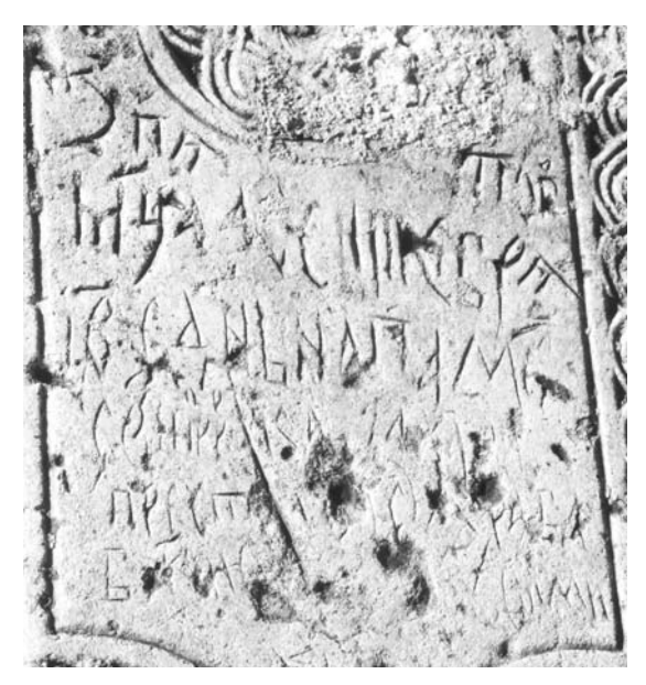
Fig. 14.54. A close-in of the lettering from an old headstone allegedly dating from the XVI century. Right next to the excellent ornamentation we see an uneven lettering that looks as though it were scratched upon the stone by a child: "7088 ... month ... on the 12th day in memory of ... the martyr ... Servant of Our Lord". The date translates as 1580 A.D. It is most likely a typical example of outright negligence typical for the authors of counterfeit epitaphs in the XVI century. The Louzhetskiy Monastery of Mozhaysk. Photograph taken in 2000.

a) The headstones with dates pertaining to the Romanovian epoch have epitaph lettering of as high a quality as the artwork of the perimeter ornaments and the forked crosses.