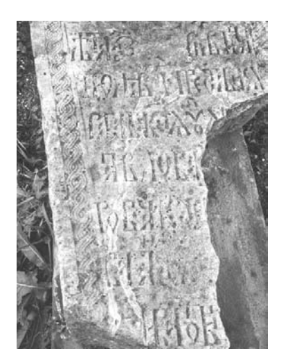
Fig. 14.45. Headstone of the old fashion with a forked cross manufactured in the epoch of the first Romanovs. The epitaph is as follows: "On 10 July of 7142, the servant of our Lord, U ... avlov ... rovich ... Kle ... rested in peace". The dots mark obliterated or illegible letters. The year translates into the modern chronological system as 1634. The quality of the lettering is just as high as that of the border ornament. The epitaph is authentic. The Louzhetskiy Monastery of Mozhaysk. Photograph taken in 2000.