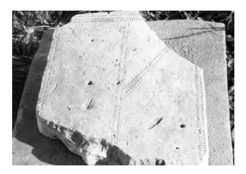
Fig. 14.41. The four-pointed cross on the ancient Russian headstone looks like a bird's footprint or a triangular forked cross with an extra branch at the top. It differs greatly from the fourpointed crosses commonly found on Christian graves. The Louzhetskiy Monastery, Mozhaysk. Photograph taken in 2000.