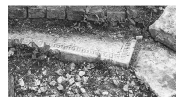
Fig. 14.33. Ancient headstone of white stone with a triangular cross engraved upon it, which was used as construction material in the foundation of the XVII century church of the Louzhetskiy Monastery in Mozhaysk. The foundation was unearthed after the excavations of 1999. Photograph taken in 2000.