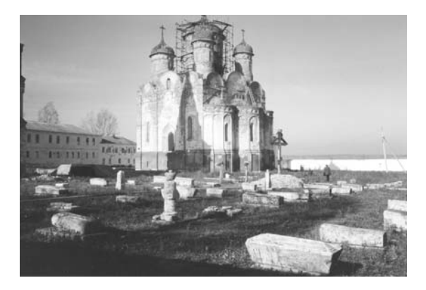
Fig. 14.28. The Louzhetskiy Monastery in Mozhaysk. We see the courtyard. In 1999, some two metres of the turf were removed. The former level of soil can be judged by the dark strip at the bottom of the monastery's cathedral. One can also see that the windows of the cathedral have been elevated except for one window, which had been at ground level when the excavations were conducted. In the foreground we see a few sarcophagi of the XVII-XIX century, unearthed during excavations and arranged in accurate rows. The level of soil in the courtyard now corresponds to that of the XVII century. Photograph taken in 2000.

Dmitriy Donskoi" ([536], page 100). The monastery exists until this day, although it has been reconstructed (see fig. 14.27).