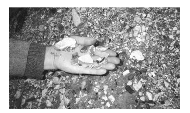
Fig. 14.44. This is all that remains of the ancient frescoes from the Cathedral of Our Lady's Nativity at the Louzhetskiy Monastery. The frescoes were chiselled off together with the plaster in the epoch of the XVIII-XIX century and piled up at the southern wall of the monastery, right next to the gate. Piles of rubble and plaster fragments were discovered here after the excavations of 1999. Photograph taken in 2000.

intact. This is where this rare old headstone was discovered (see figs. 14.42 and 14.43).