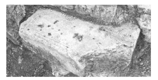
Fig. 14.37. Headstone of white stone with a triangular cross engraved upon it. Used as construction material in the foundation of a XVII century church. Louzhetskiy Monastery, Mozhaysk. Photograph taken in 2000.