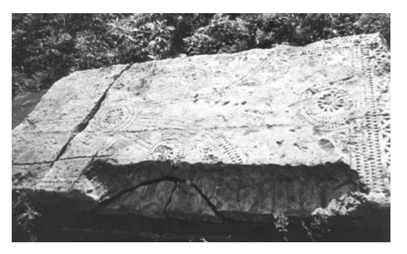
Fig. 14.42. Ancient Russian headstone with a five-pointed forked cross uncovered from the XVII century masonry of the Louzhetskiy Monastery in Mozhaysk. Photograph taken in 2000.