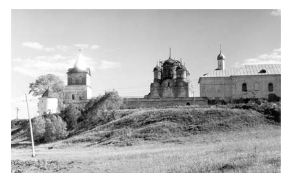
Fig. 14.27. The Louzhetskiy Monastery of Our Lady's Nativity in Mozhaysk. View from the north. Photograph taken in 2000.