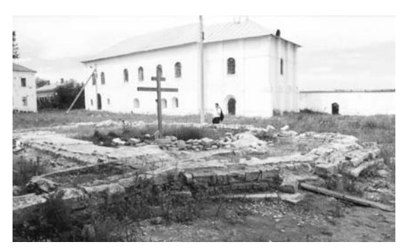
Fig. 14.30. Louzhetskiy Monastery in Mozhaysk. The foundation of a destroyed XVII century church with old Russian headstones used as construction material. According to the writings on the headstones, we see the remains of construction works conducted in 1669 or later. Photograph taken in 2000.

to the thickness of the removed layers – it was painted with dark paint after exposure. These excavations in the friary courtyard revealed an amazing picture, which we shall relate in the present section. We are very grateful to Y. P. Streltsov, who had pointed out to us the facts that we shall be referring to herein.