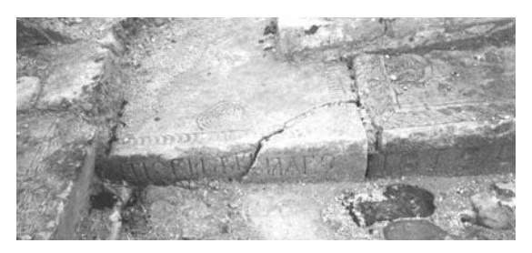
Fig. 14.38. Headstones of white stone with triangular crosses immured in the foundation of a XVII century church. One of them is marked "7 February 7191". The dating converts into the modern chronological system as 1683 A. D. Louzhetskiy Monastery, Mozhaysk. Photograph taken in 2000.