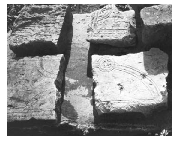
Fig. 14.40. Fragments of the ancient Russian headstones used in the XVII century masonry of the Louzhetskiy Monastery in Mozhaysk. Photograph taken in 2000.