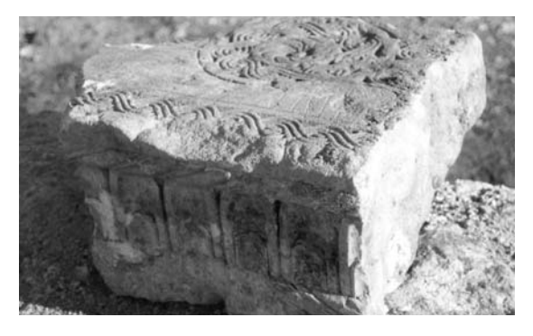
Fig. 14.39. Fragment of a headstone with an exceptionally large triangular cross engraved upon it. We see the central part of the cross, which has remained intact. Apart from that, on the side of the headstone we see the remnants of an ornament that one often sees on other old Russian headstones. From the masonry of the XVII century church at the Louzhetskiy Monastery in Mozhaysk. Photograph taken in 2000.