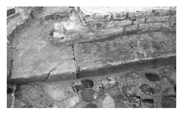
Fig. 14.34. Headstones of white stone with engraved triangular crosses. Immured in the foundation of a XVII century church. Louzhetskiy Monastery, Mozhaysk. Photograph taken in 2000.