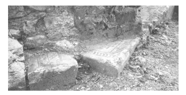
Fig. 14.35. Headstones of white stone with engraved triangular crosses. Used as construction material in the foundation of a XVII century church. Louzhetskiy Monastery, Mozhaysk. Photograph taken in 2000.