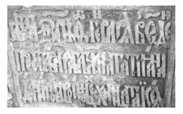
Fig. 14.31. A XVII century headstone immured in the foundation of the demolished church of the Louzhetskiy Monastery, which was uncovered during the excavations of 1999. The epitaph reads: "Our Lord's servant, Sister Taiseya, formerly Tatiana Danilovna, died on the 5th day of January in the year of 7159". The year corresponds to 1651 A.D. Photograph taken in 2000.