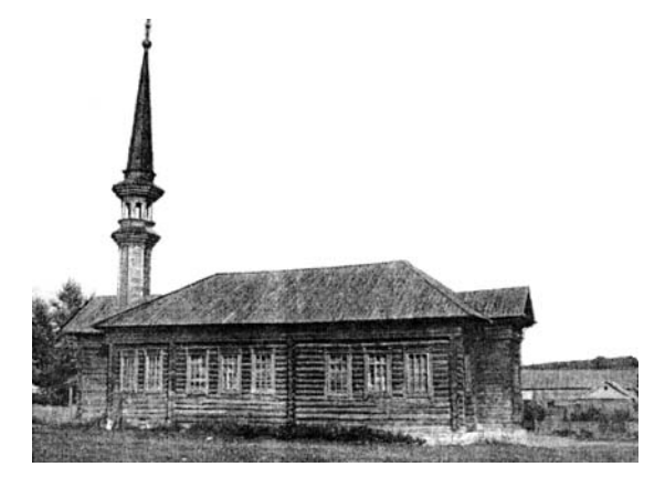
Fig. 14.239. Mosque at Asan-Yelg. Republic of Tartarstan. Gothic cathedrals in the West are shaped similarly. Taken from [760:1], page 231.

The architecture of the cathedral is classified as "pseudo-Gothic" ([536], page 80). It must be for a good reason that in 1806 Bakaryov built the Nikolskaya Tower of the Muscovite Kremlin, which had for a long time housed the Mozhaysk icon of St. Nicholas the Miracle-Worker, in the same Gothic style. Apparently, the memory of the ancient Russian Gothic churches had been kept alive in Mozhaysk for a long time.