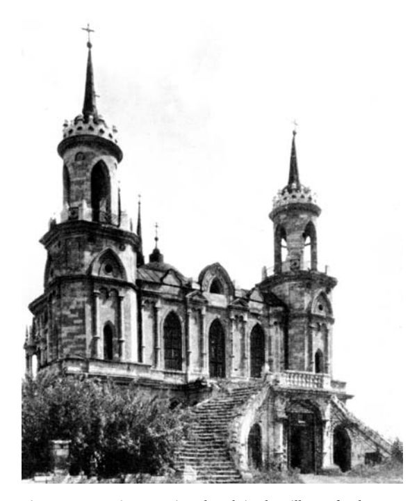
Fig. 14.233. Ancient Russian church in the village of Bykovo. It is classified as "pseudo-Gothic" nowadays. Apparently, some of the churches built in the old style of the Horde have survived in small Russian towns and villages. Taken from [311], illustrations at the end of the book.

emphasise that this building bears no marks of reconstructions distorting its original architecture – it doesn't even have any spires. Apparently, this is what the old Russian churches really looked like in the XV-XVI century.