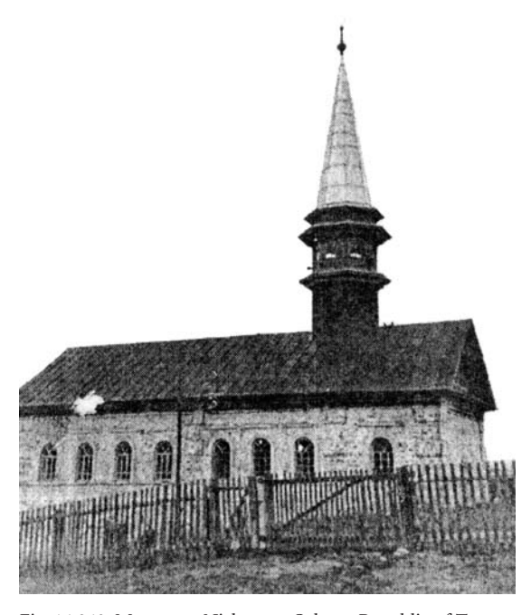
Fig. 14.240. Mosque at Nizhnyaya Oshma. Republic of Tartarstan. Gothic cathedrals in the West are shaped similarly.

The old Horde style was preserved in the construction of many Muslim mosques predating the XIX century. For instance, in figs. 14.236 - 14.240 we reproduce photographs of some of the mosques in Tartarstan. It is perfectly obvious that their architecture is virtually the same as that of the Gothic cathedrals in the Western Europe. It has to be pointed out that, according to [760:1], there are a great many such