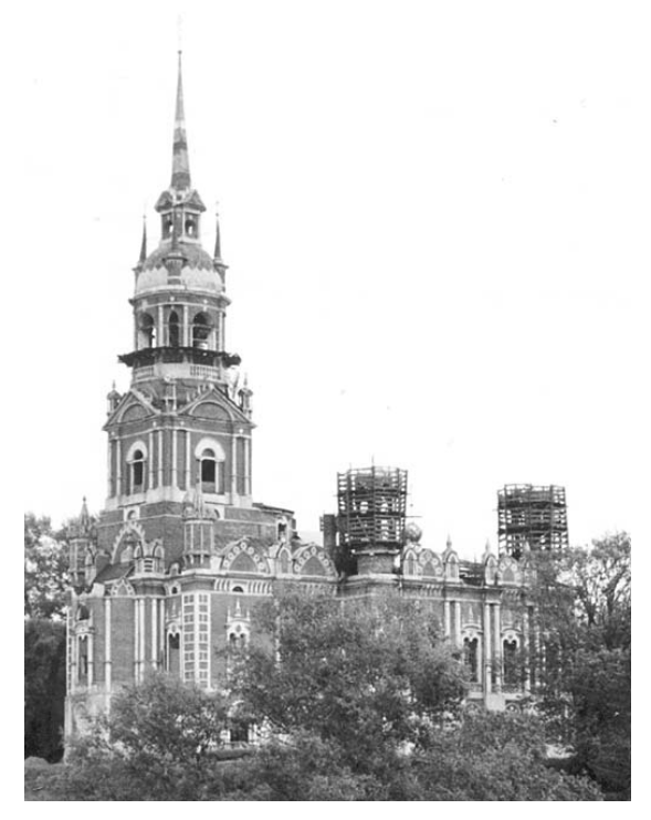
Fig. 14.234. The principal cathedral of Mozhaysk (the New Nikolskiy Cathedral) was built in the Gothic style. Photograph taken in 2000.

One must say that some of the modern specialists in the history of architecture have noticed the few surviving Russian churches built in the Gothic style. How-