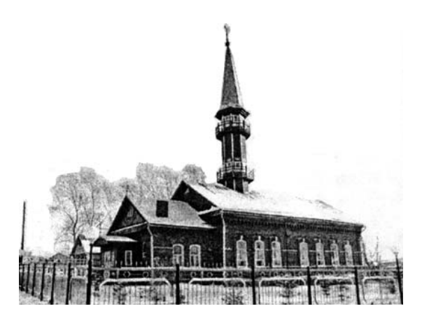
Fig. 14.238. Mosque at Stariy Bagryazh-Yelkhov. Republic of Tartarstan. Gothic cathedrals in the West are shaped similarly. Taken from [760:1], page 46.

of the XIX century, it had played an important part in the history of the Russian pseudo-Gothic style" ([311], page 32).