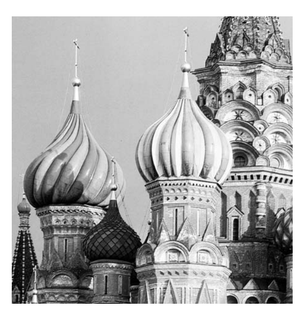
Fig. 14.241. Spiral dome of the German Clementskirche in Mayen, near Bonn.

In fig. 14.241 we see the German church in Mayen, a town located in the vicinity of Bonn. It is called Clementskirche; its dome is shaped very quaintly, as upward spirals. The church was greatly damaged in 1941-1945; however, it was rebuilt in full accordance with the surviving drawings. It is presumed that the construction of the Clementskirche began in 1000, and that the church had then been rebuilt several