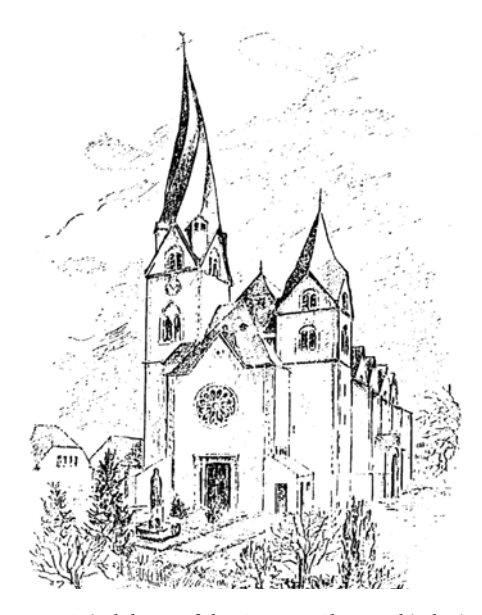
Fig. 14.241. Spiral dome of the German Clementskirche in Mayen, near Bonn.

hind it. Quite naturally, one can hardly speak of any direct connexions between the Czech churches and the Muscovite cathedral" ([311], page 97). Ilyin is obviously confused by the erroneous Scaligerian and Millerian chronology. Further he writes: "It is obvious that these similarities reflect some general tendency that was characteristic for the entire mediaeval Europe. In other words, the spatial features of the Ouspenskiy cathedral are related to the Gothic space of the Western cathedrals" ([311], page 97). Nowadays we understand the reasons behind the similarities noticed by the modern specialists in the history of architecture. Western Europe had been part of the Great = "Mongolian" Empire up until the XVII century; the Gothic (Cossack) style had been prevalent throughout the entire empire.