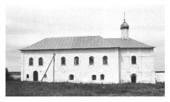
Fig. 14.235. The old church at the Louzhetskiy Monastery of Mozhaysk. It is likely to have looked like a Gothic cathedral as well. Photograph taken in 2000.