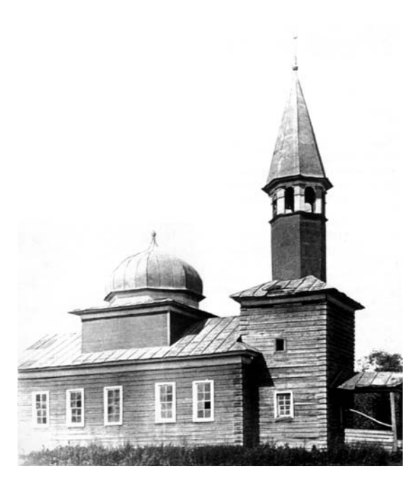
Fig. 14.229. A mosque in the village of Poiseyevo, Tartarstan. It is built in the Gothic style. Taken from [6], page 21.

"a house". Likewise, name "gothic" is derived from the word "Goth" - the ancient synonym of the word "Cossack". This is the architecture that was brought to the Western Europe by the Cossack troops of the Great = "Mongolian" Empire in the XIV-XV century (see CHRON5 for more details).