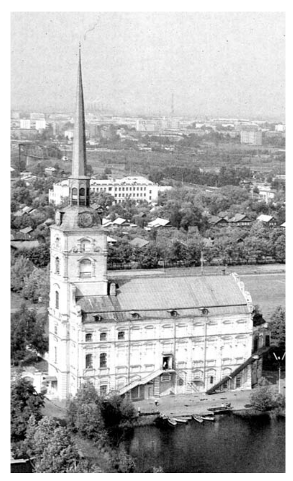
Fig. 14.227. The Gothic Cathedral of Peter and Paul in Yaroslavl, built in the Old Russian style of the Horde. We see a spire, a gable roof and a first floor entrance. Taken from [996], page 159.