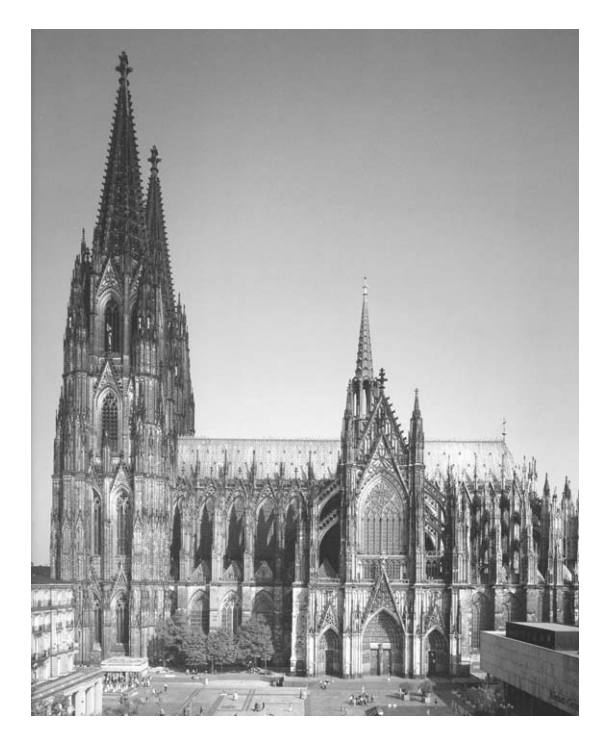
Fig. 14.220. The gothic Cologne Cathedral as it looks today. Cologne, Germany. Taken from [1017], photograph 3.