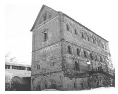
Fig. 14.232. Old building at the New Simonov Monastery in Moscow. General view. Photograph taken in 2000.