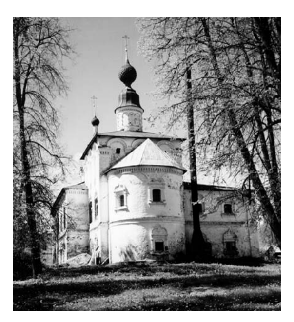
Fig. 14.225. The Church of Presentation, Nikolo-Ouleimenskiy Monastery, Ouglich. Eastern view. A more recent square block topped by a cylinder and also characterised by a semicircular altar part was adjoined to the old building in some later epoch. Photograph taken in 2000.

One must also enquire about the fate of the churches built in the XVI century. Could it be that the residents of Ouglich had abstained from building churches for more than a century? Or have those churches "disintegrated" all by themselves? Oddly enough, there are many XVII century churches in Ouglich. It must be pointed out that the XV century Church of St. Alexei is a huge cathedral, one of the largest churches in Ouglich to date. Having built such a cathedral in the XV century, the people of Ouglich must have also built something in the XVI century. One gets the impression that nearly every church in Ouglich was rebuilt in the XVII century. The Church of St. Alexei must have survived by miracle; therefore, it looks out of place amidst the churches that are said to represent the typical architectural style of the ancient Russia. One must emphasise that all these "typically Russian" churches were built in the XVII century the earliest.