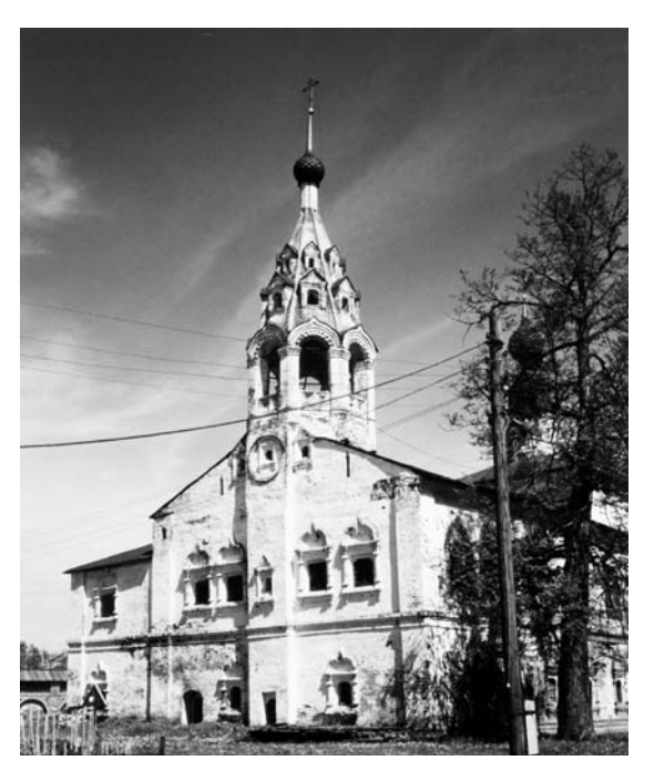
Fig. 14.226. The Church of Presentation, Nikolo-Ouleimenskiy Monastery, Ouglich. View from the southeast. Photograph taken in 2000.

This observation is confirmed by another example. Let us turn to the architecture of the famous Rus-