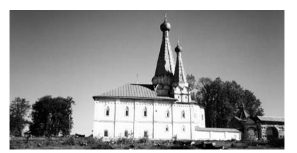
Fig. 14.221. Church of Metropolitan Alexei in Ouglich. Southern view. The only church in Ouglich that has survived from the epoch of the XV-XVI century. Photograph taken in 2000.