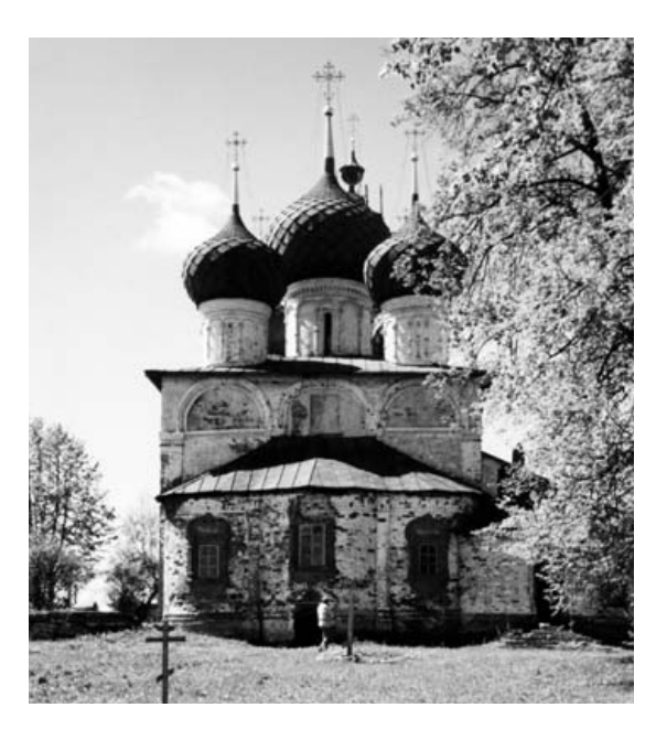
Fig. 14.218. A typical Russian church of the XVII century. This is the Nikolskaya Church of the Nikolo-Ouleymenskiy Monastery near Ouglich. We see the eastern wall of the church. It is presumed that most Russian churches of the XII-XVI century had looked like this.