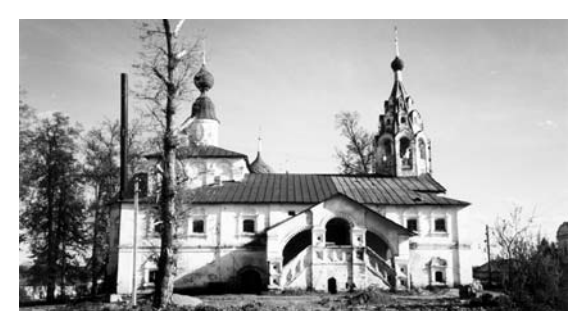
Fig. 14.224. The Church of Presentation, the Nikolo-Ouleimenskiy Monastery, Ouglich. Northern view. The church is entered via a tall porch that leads directly to the first floor. Photograph taken in 2000.