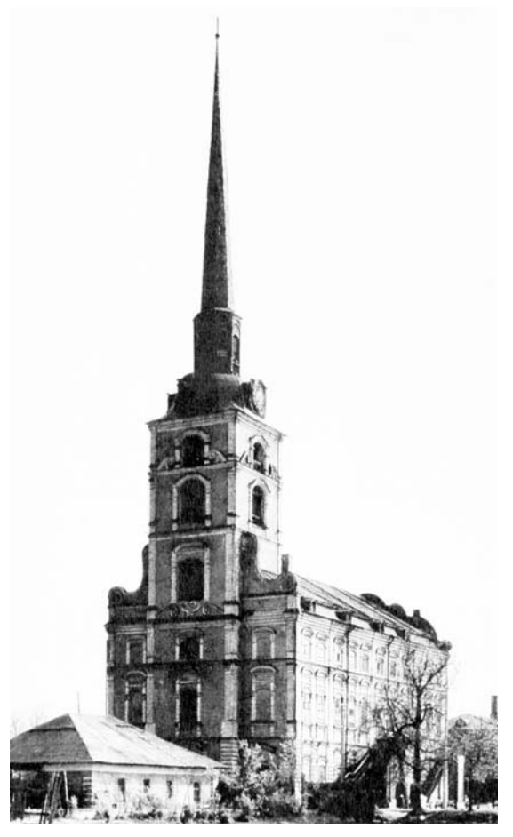
Fig. 14.228. Another photograph of the Gothic Cathedral of Peter and Paul in Yaroslavl. This is precisely the style the West Europeans built their cathedrals in, originating from the Horde, or "Mongolia". Taken from [116], ill. 341.

mentioned facts make one doubt this; one gets the impression that in the XVII century the overwhelming majority of the Russian churches were rebuilt in the "Greek" manner favoured by the Reformists. Moreover, the latter made the claim that Russian churches had always looked like this, which is a blatant lie, as we realise today.