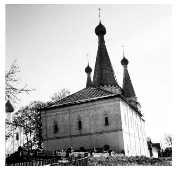
Fig. 14.223. Church of Metropolitan Alexei in Ouglich. Western view. Photograph taken in 2000.