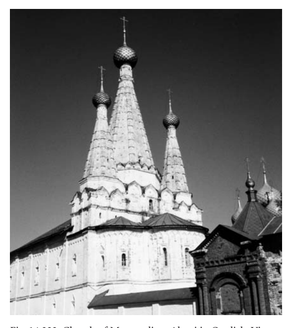
Fig. 14.222. Church of Metropolitan Alexei in Ouglich. View from the southeast. Photograph taken in 2000.