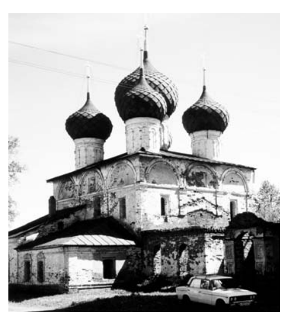
Fig. 14.219. A typical Russian church of the XVII century. We see the northwest view of the Nikolskaya Church, Nikolo-Ouleymenskiy Monastery, Ouglich. Most Russian churches of the XII-XVI century are supposed to have been constructed in the same manner as this one.

buildings with tall gable roofs, usually topped by a spire, or several spires. The famous gothic Cologne Cathedral is a most typical example (see fig. 14.220). It is presumed that such churches had been built in Europe since times immemorial, whereas the Russian churches had always looked the way they do today the "cubic" constructions that we know today. We are referring to the Russian churches that are presumed to date from the XII-XVI century nowadays.