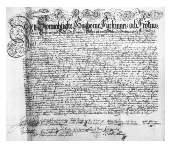
Fig. 14.184. Missive sent by the Swedish senators to Czar Mikhail Fyodorovich in re the demise of Gustav-Adolph, King of Sweden, and his daughter Christine crowned queen. 1633. Complex tugra. State Archive of Ancient Acts. Taken from [330:1], page 251.