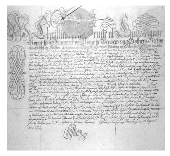
Fig. 14.183. Missive sent by Christian V, King of Denmark, to Czar Peter the Great with a promise of support to the Kurfürst of Saxony in his struggle for the Polish throne. 1697. Complex tugra. State Archive of Ancient Acts. Taken from [330:1], page 249.

Czar to the Novodevichiy Monastery, qv in fig. 14.192. A most complex multicolour tugra with golden details can be seen in a bestowal certificate issued by Peter the Great, qv in fig. 14.193.