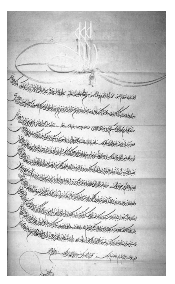
Fig. 14.181. Missive sent by Sultan Amourat IV to Czar Mikhail Fyodorovich in re the attack on Azov by the Cossacks of Don. We see a luxurious tugra. State Archive of Ancient Acts. Taken from [330:1], page 246.

of Borovsk near Moscow, qv in figs. 14.188 and 14.189. At the top of the document we see a huge tugra, complex and exquisite; it occupies a large part of the page.