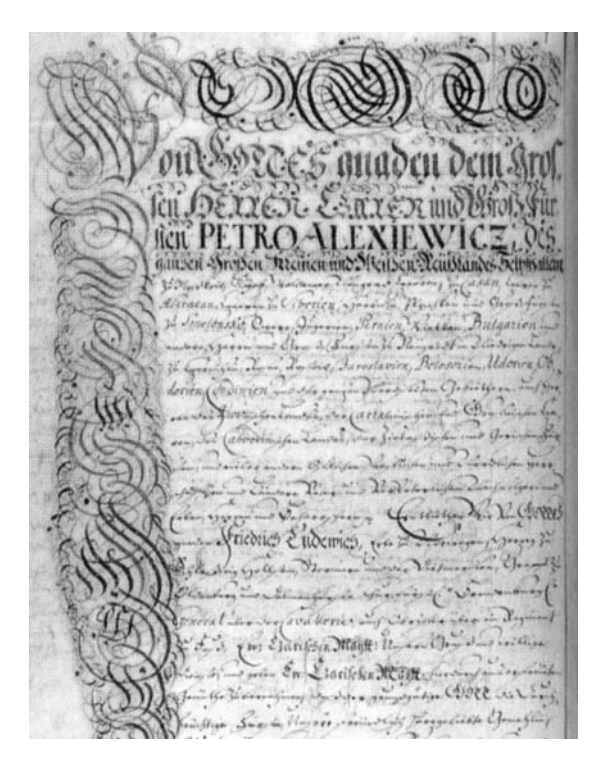
Fig. 14.185. Missive sent by Frederick-Ludwig, Duke of Schleswig-Holstein to Peter the Great with a request to be the godfather of his newborn child. 1697. Luxurious tugra. State Archive of Ancient Acts. Taken from [330:1], page 252.