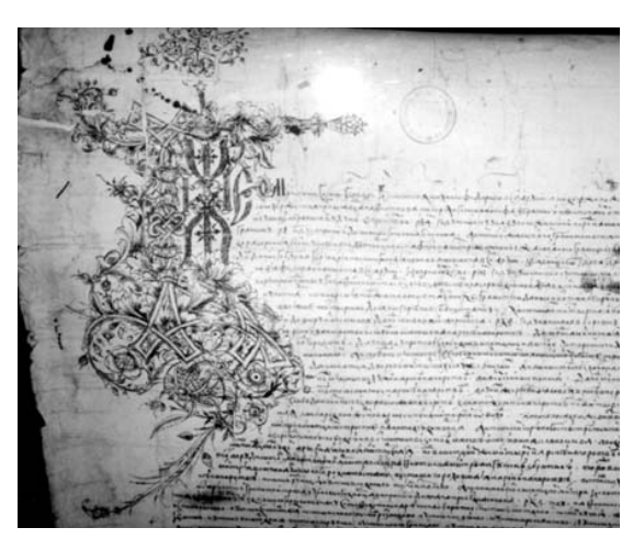
Fig. 14.189. Close-in of a fragment of the document issued by Mikhail Romanov in 1624. We can clearly see a very elaborate tugra. The complexity of this "signature" secured the document from forgery. Photograph taken at the Pafnoutievskiy Monastery in May 1999. Such tugras were usually drawn on authentic documents issued by the Russian Czars and the Ottoman Sultans in the XVI-XVII century. The Turks have kept this tradition for longer. On the other hand, we see no tugras on the XVII-XVIII century forgeries presented to us as authentic documents issued by the Russian Czars in the XVII-XVIII century. It was too complex a task to copy such a pattern. The hoaxers contented themselves with the falsification of seals, which required less skill and effort from their part all they needed was a print of the real seal.