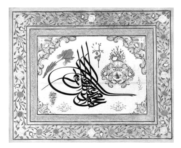
Fig. 14.179. A complex tugra used by Sultan Mahmoud II as a signature. Taken from [1465], page 55.

Our opponents might suggest that the Russians had never used tugras, being a backward nation with inexperienced government officials, and that the tugras were a Turkish, or Ottoman invention adopted by the Westerners, unlike the Russians, who had merely used seals. However, this is not true. Let us