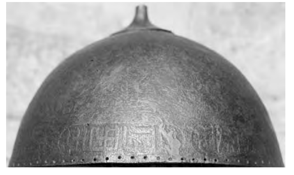
Fig. 13.20c. Close-in of the second Russian helmet in the museum of Kolomenskoye. The lettering on the helmet is non-Cyrillic – possibly, Arabic. It has to be pointed out that there is a distinctly visible swastika on the helmet.