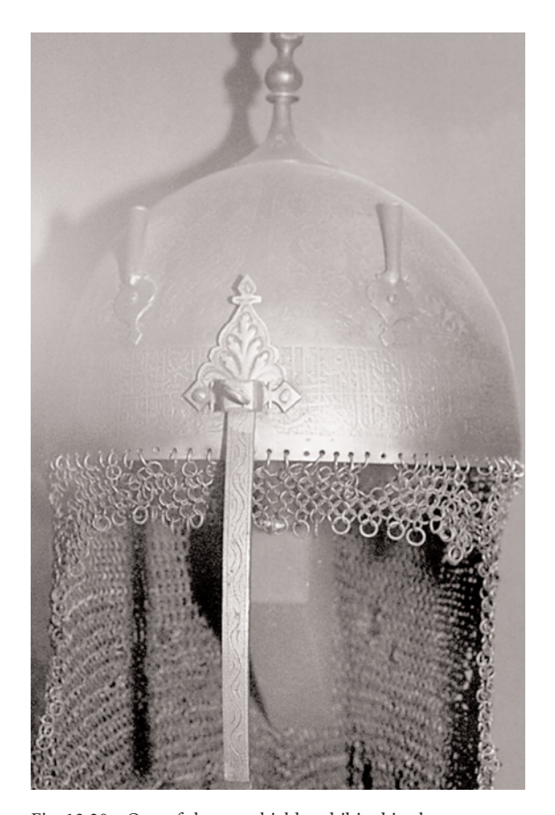
Fig. 13.20a. One of the two shields exhibited in the museum of Kolomenskoye in Moscow. According to the explanatory plaque, the helmet was made in Russia; however, the plaque doesn't say a single word about the Arabic lettering present on the helmet. It is visible well on the photograph (wide strip at the bottom).