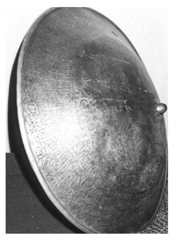
Fig. 13.16. Russian shield covered in Arabic lettering. Museum of the Raspyatskaya church in Alexandrovskaya Sloboda.