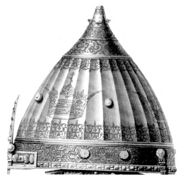
Fig. 13.22. Fragment of Alexander Nevskiy's helmet ("Jericho hat?") with Arabic lettering.

another example - the famous helmet of Alexander Nevskiy. We haven't managed to find it anywhere during our visit to the armoury in 1998 (alternatively, it may identify as the abovementioned "Jericho Hat"). It is also possible that it had been removed from exposition temporarily; however, we do not find it in the famous fundamental album entitled The State Armoury ([187]). We haven't managed to find it in any of the other accessible albums on the museums and history of the Kremlin in Moscow. We have accidentally come across a drawing of Alexander Nev-