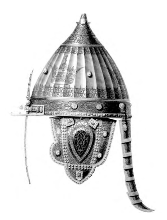
Fig. 13.21. Helmet of Alexander Nevskiy ("Jericho hat?"). According to the historians themselves, the lettering on the helmet is Arabic. From a copy of "Antiquités de l'empire Russe, édités par orde de Sa Majesté l'empereur Nicolas I" kept in the public royal library of Dresden, Germany. The photograph that we reproduce here was taken from the cover of the "Russkiy Dom" magazine, issue 7, 2000. The legend next to the helmet says "760 years of the Battle of Neva". A small photograph of this helmet was also reproduced in the article about Alexander Nevskiy. However, historians eventually "recollected" that the helmet in question dates from the epoch of the Muscovite Czars of the XVI-XVII century. See also [336], Volume 5, inset between pages 462 and 463.

another example - the famous helmet of Alexander Nevskiy. We haven't managed to find it anywhere during our visit to the armoury in 1998 (alternatively, it may identify as the abovementioned "Jericho Hat"). It is also possible that it had been removed from exposition temporarily; however, we do not find it in the famous fundamental album entitled The State Armoury ([187]). We haven't managed to find it in any of the other accessible albums on the museums and history of the Kremlin in Moscow. We have accidentally come across a drawing of Alexander Nev-