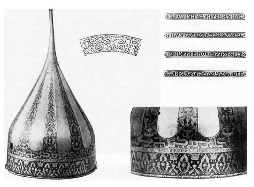
Fig. 13.24. Helmet of Ivan the Terrible. XVI century. Royal Museum of Stockholm. We see a wide strip with Arabic lettering, with a narrower strip with Russian lettering underneath. Taken from [331], Volume 1, page 131.

In Chron7, Annex 2 we cite a number of exclusive materials, namely, the inventory of the ancient Russian weapons stored in the State Armoury of the Kremlin in Moscow. This inventory demonstrates that the inscriptions found upon Russian weapons and considered Arabic today are typical and not a mere number of rare exceptions.