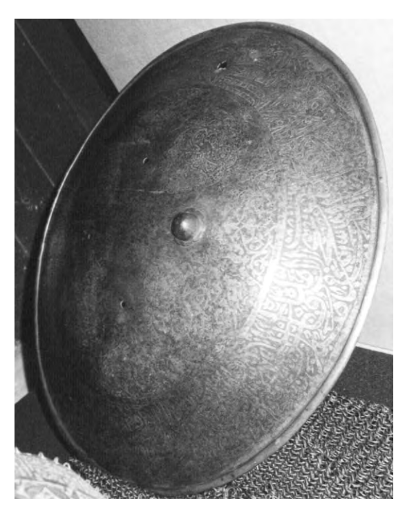
Fig. 13.17. Russian shield covered in Arabic lettering. Museum of the Raspyatskaya church in Alexandrovskaya Sloboda.