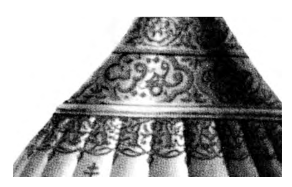
Fig. 13.23. Close-in of a fragment of Alexander Nevskiy's helmet.

skiy's helmet in a rather rare multi-volume edition entitled History of Humanity. Global History ([336], published in Germany and dating from the end of the XIX century). We have then found a photograph of this helmet in the "Russkiy Dom" magazine (issue 7, 2000). We reproduce it in fig. 13.21; it turns out that there's an Arabic inscription upon the helmet of Alexander Nevskiy (figs. 13.22 and 13.23). The commentary of the German professors is as follows: "Helmet of Great Prince Alexander Nevskiy, made of red copper and decorated with Arabic lettering. Made in