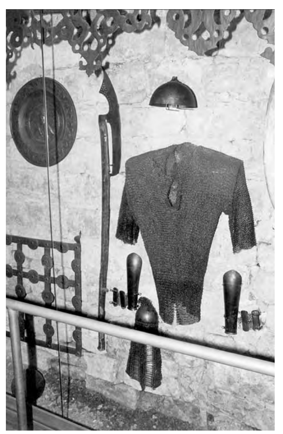
Fig. 13.20b. Ancient armaments of a Russian warrior in the museum of Kolomenskoye in Moscow. Chain mail, mace, helmet etc.