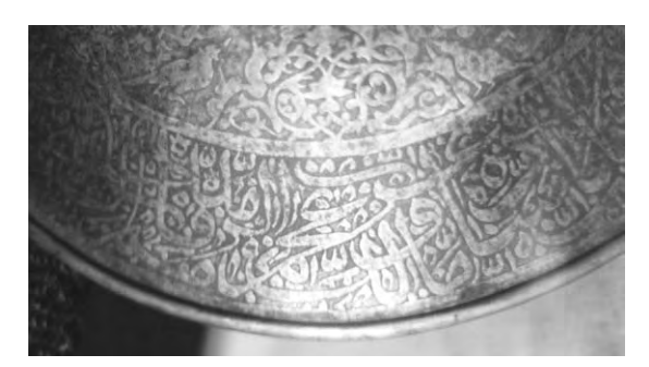
Fig. 13.20. Russian shield covered in Arabic lettering. Museum of the Raspyatskaya church in Alexandrovskaya Sloboda.