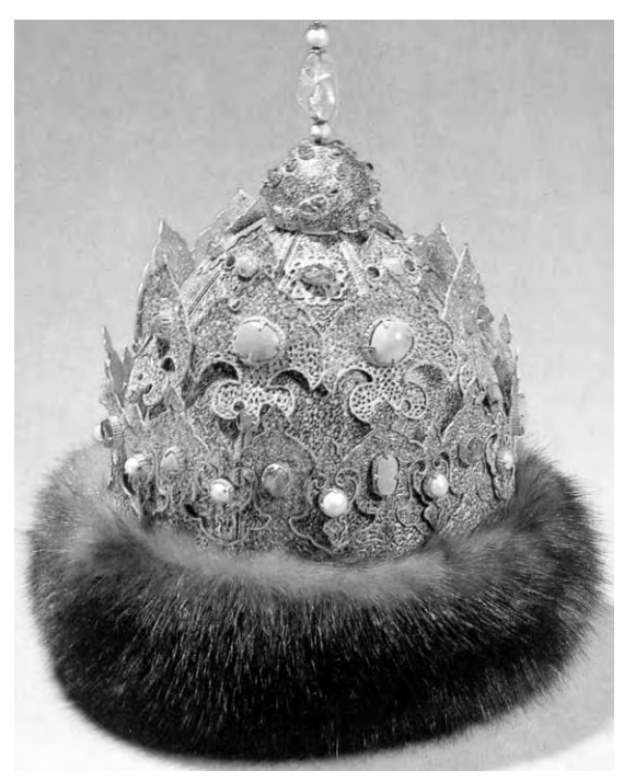
Fig. 13.26. The Kazan Hat (ceremonial headdress of Ivan the Terrible). Armaments Chamber, Moscow. Presumed to be made in Russia "with the assistance of Oriental craftsmen" ([187], pages 386-387). The presumption about the participation of the "Oriental craftsmen" stems from the fact that the modern commentators fail to understand that the "Oriental style" is simply the old Russian style of the XV-XVI century. Its origins are purely Russian; it wound up in the Orient during the Great = "Mongolian" conquest of the XIV-XV century. Taken from [187], page 346.

We have already pointed out the fact that many Russian weapons, as well as the ceremonial attire of the Russian Czars and even the mediaeval mitre of a Russian bishop are all adorned by Arabic inscriptions, some of which can be identified as passages from the Koran (see Chron4, Chapters 13:1-2). This