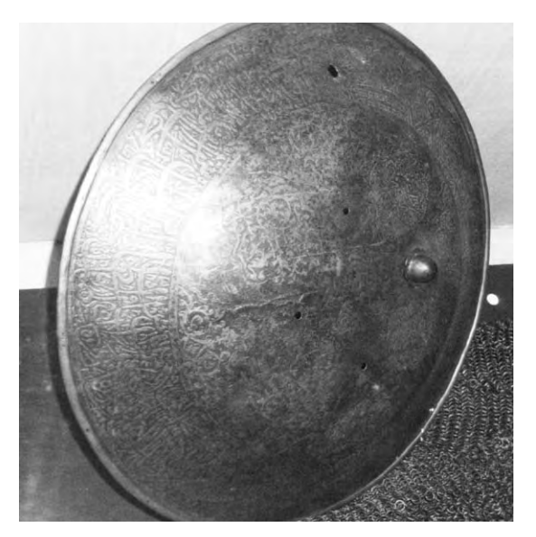
Fig. 13.19. Russian shield covered in Arabic lettering. Museum of the Raspyatskaya church in Alexandrovskaya Sloboda.