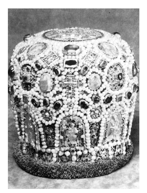
Fig. 13.25. Mitre of 1626. A donation made by the Russian princes of Mstislavskiy. We see a large gemstone in front with Arabic lettering carved upon it. Taken from [809].

an Arabic inscription carved into the stone; however, nobody in the museum knew anything about the possible translation.