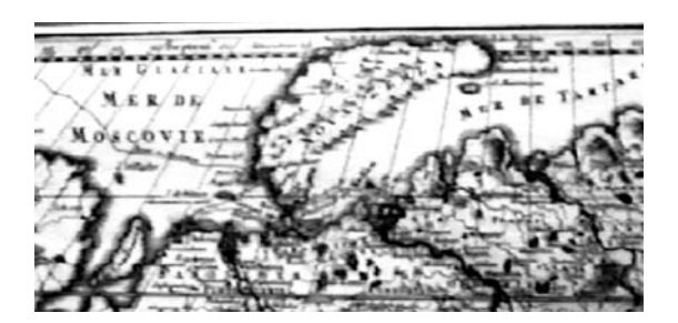
Fig. 12.46. A French map of the Great Tartary allegedly dating from the end of the XVII century. La Grande Tartarie Orientale. Anonym. France (?) Was put up at the exhibition of the maps of Russia dating from the XVI-XVIII century held at the museum of Private Collections at the Pushkin Museum in Moscow (February-March 1999). From a video recording of 1999.

in actual history. Early maps were of low precision, but they have been evolving in a more or less regular manner, as new geographical data were procured. Correct geographical data that became known to the cartographers have never been forgotten - once they made their way onto the maps, they stayed there. The precision of the maps kept on growing steadily - there were no epidemics of forgetfulness in the history of cartography.