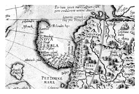
Fig. 12.45. Fragment of another map allegedly dating from 1595 and ascribed to Gerhard Mercator. Novaya Zemlya is depicted correctly - as an island. Taken from [1160], page 94.