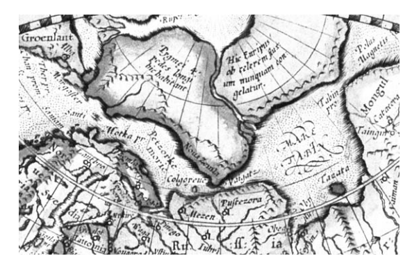
Fig. 12.44. Fragment of Rumold Mercator's map allegedly dating from 1587, where we see Novaya Zemlya drawn correctly - as an island. We see the words "Nova Zemla" below the island. Taken from [1160], pages 97-98.