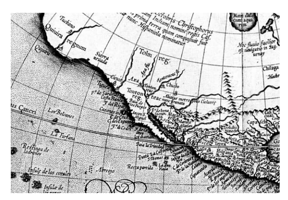
Fig. 12.27. A fragment of Mercator's map with correctly drawn Californian peninsula. Taken from [1009], page 96.

anything but complete, despite his attempts to gather all the materials he could find. He tells us the following: "Future historians who shall receive the permission to study the Pougachev files shall find it easy to expand and correct my work" ([709], page 661).