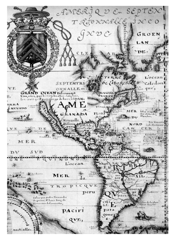
Fig. 12.22. French map of 1633 (Carte Universelle Hydrographique. Jean Guerard. Pilote et Hydrographe à Dieppe, 1634). California is erroneously drawn as an island. Published in the "L'Art du Voyage" calendar of 1992 published by Air France.