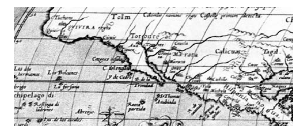
Fig. 12.25. A fragment of the map by Abraham Ortelius where the Californian peninsula is drawn correctly.

of Pougachev, wherein he collected "everything the government had divulged, as well as the foreign sources that struck me as veracious and contained references to Pougachev" ([709], page 661). However, A. S. Pushkin had only managed to gather enough materials for a relatively small publication - his biography occupies a mere 36 pages in [709]. The author had apparently been aware that this work of his was