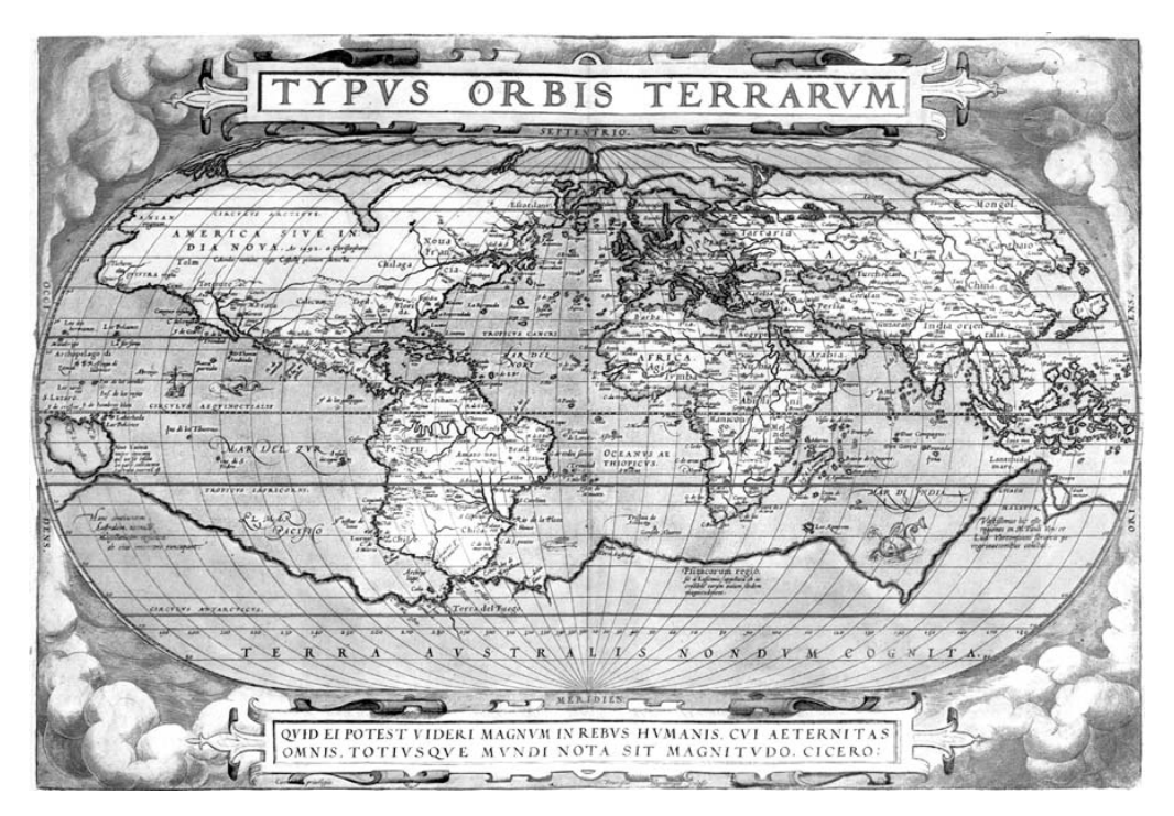
Fig. 12.24. A map by Abraham Ortelius allegedly dating from 1579. North America is drawn a great deal more accurately here than what we see on the maps drawn by much later cartographers of the late XVIII century. The Californian peninsula is drawn correctly. Taken from [1009], page 81.