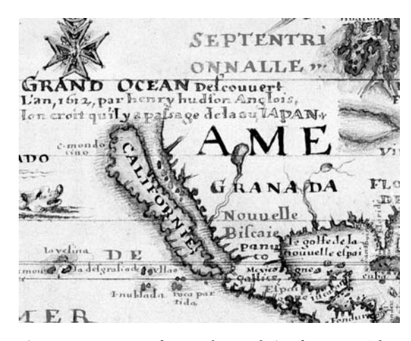
Fig. 12.23. Fragment of a French map dating from 1634. The Californian peninsula is misrepresented as an island.

We are being told that the European cartographers shall forget all the abovementioned data a mere 100 years later, in the XVII-XVIII century, and get a multitude of misconceptions into their heads, such as the insular nation of California. Isn't this highly suspicious?