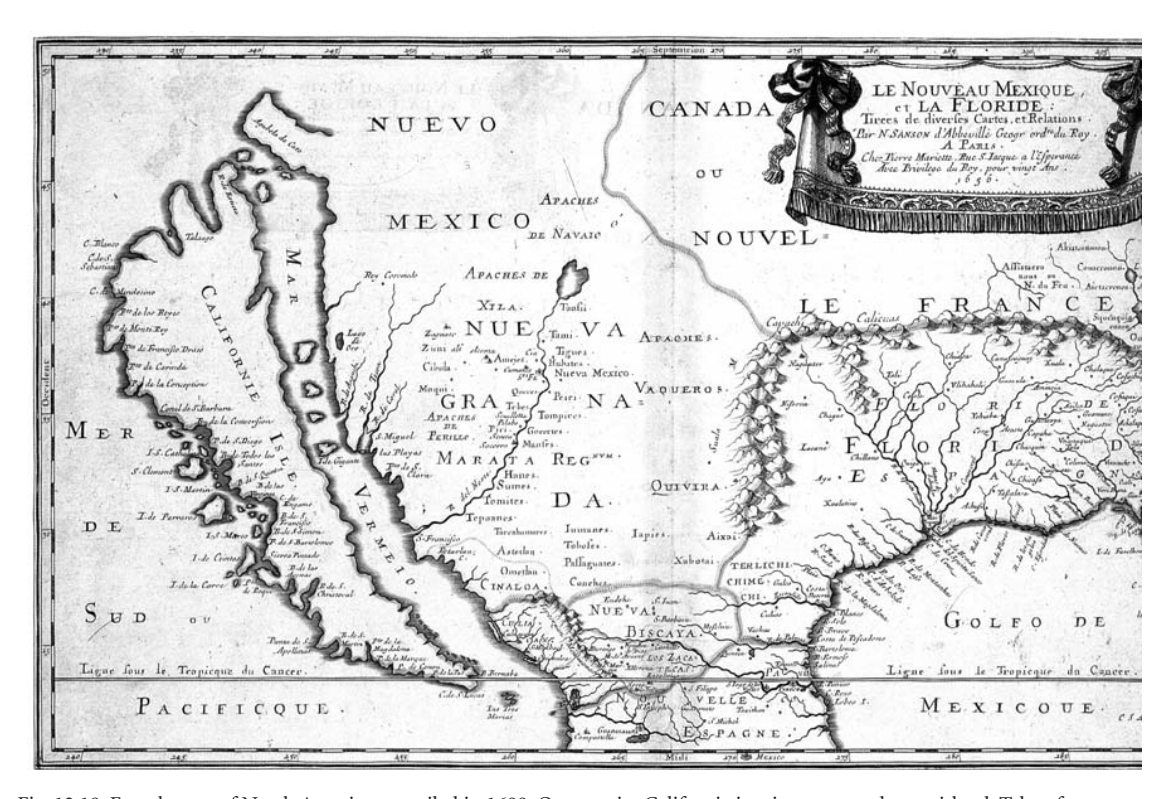
Fig. 12.19. French map of North America compiled in 1688. Once again, California is misrepresented as an island. Taken from [1160], pages 152 and 153.

Let us return to the maps of America – the ones dating from the alleged XV-XVI century this time, in order to see how the European cartographers of the