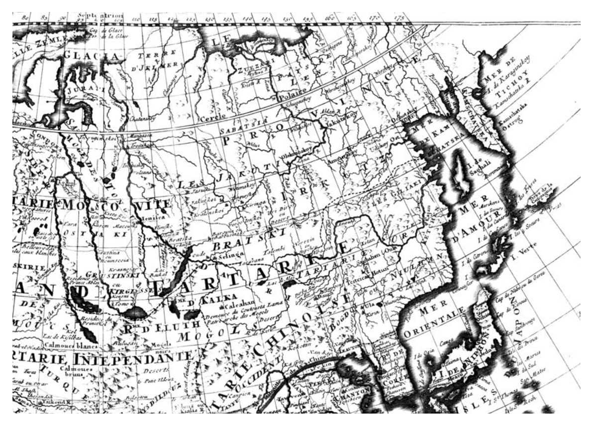
Fig. 12.16. Second fragment of the XVIII century French map. Taken from [1018].

By the way, the Britannica reports the existence of another "Tartar" state in the XVIII century - Independent Tartary with a capital in Samarqand ([1118], Volume 2, pages 682-684). As we are beginning to realise, it had been yet another remnant of the Horde that existed as a single empire in the XIV-XVI century. The fate of this state is known, unlike that of the Muscovite Tartary - the Romanovs conquered it in the middle of the XIX century. We are referring to the so-called "conquest of Central Asia", as it is evasively called in the modern textbooks. The conquest had been very violent, and the name Independent Tartary disappeared from the maps forever. It is still known to us under the very neutral alias of "Central Asia". Samarqand, the capital of the Independent Tartary, was taken by the Romanovian troops in 1868 ([183], Volume 3, page 309). The entire war lasted four years (1864-1868).