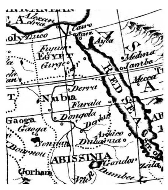
Fig. 12.10. Fragment of an XVIII century map of Africa with the environs of the Nile. Taken from [1118], Volume 2, pages 682-683. Plate XC.

and Vyatka, well familiar to us from the ancient Russian history (see Chron4, Chapter 14:20). The mediaeval Perm identifies as Germany, whereas the mediaeval Vyatka had been in Italy (the name Vatican is a possible derivative – cf. Batu-Khan). These names of the old Imperial provinces had been present in the