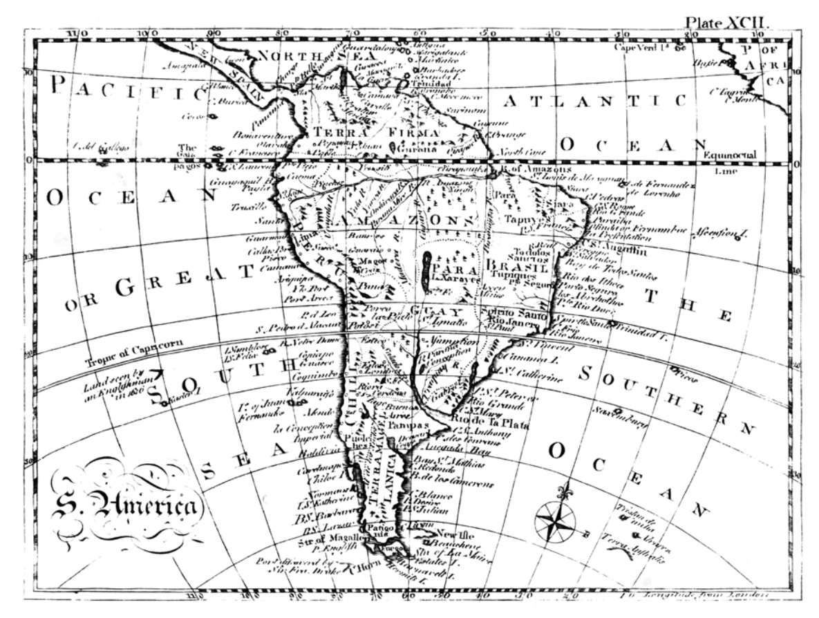
Fig. 12.5. A map of South America from the Encyclopaedia Britannica (an XVIII century edition). Taken from [1118], Volume 2, pages 682-683. Plate XCII.

cient" Luxor and Thebes here, whose age is measured in many millennia, relics of the Pharaohs' supreme power. However, even the modern maps have the town and the oasis of Harga drawn some 200 kilometres to the West of Luxor - also a possible derivative of "Gyurgiy" or "Youri".