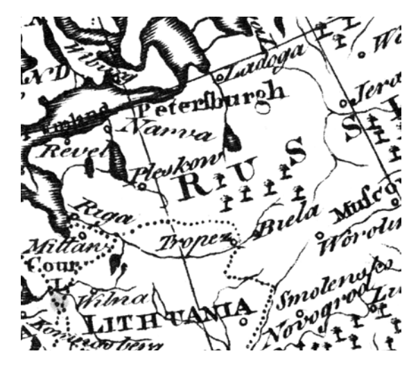
Fig. 12.7. Fragment of an XVIII century map of Europe where we see the environs of River Volkhov. We don't see the city of Novgorod anywhere; however, there is a Novgorod to the south of Smolensk - the famous city of Novgorod-Severskiy, which exists until the present day. Taken from [1118], Volume 2, pages 682-683. Plate LXXXVIII.