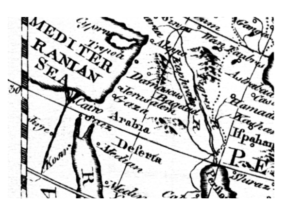
Fig. 12.9. Fragment of an XVIII century map of Asia with the Holy Land. Taken from [1118], Volume 2, pages 682-683. Plate LXXXIX.

A propos, this is when the Romanovs had started to draw the names of the Great = "Mongolian" Empire's provinces on the map of Russia, such as Perm