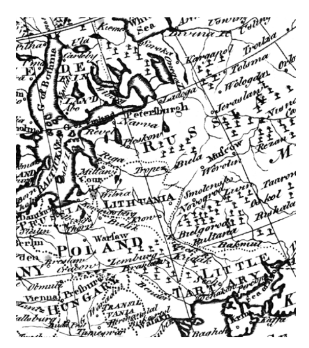
Fig. 12.6. Fragment of an XVIII century map of Europe showing the western part of Russia. Taken from [1118], Volume 2, pages 682-683. Plate LXXXVIII.

It is just as surprising as it is noteworthy that the authors appear to be perceiving the Russian Empire as the sum of several countries - namely, Russia, with a capital in St. Petersburg and an area of 1.103.458