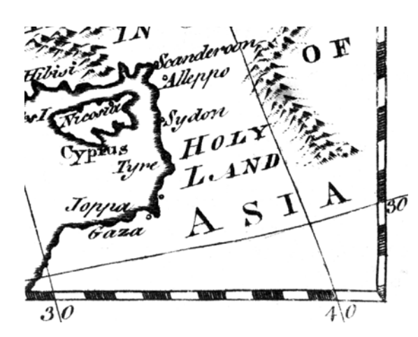
Fig. 12.8. Fragment of an XVIII century map of Europe with the Holy Land. Taken from [1118], Volume 2, pages 682-683. Plate LXXXVIII.