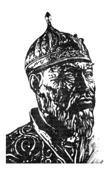
Fig. 11.1. Gerasimov's reconstruction of the face of the man from the mausoleum of Tamerlane in Samargand. The features are distinctly European; Gerasimov didn't manage to smooth them out in any which way despite all his attempts. Taken from [829], page 2.

Let us try walking in Gerasimov's shoes. His method yields a portrait that looks perfectly Caucasian (see fig. 11.1). However, it is "commonly known" that Timur had been a "Mongol" - that is to say, he came from the distant Mongolia. A public declaration of the fact that Timur had really been a Caucasian would instantly discredit Gerasimov and his method that "transforms Mongols into Europeans". His reputation of a scientist would instantly become flawed. On the other hand, Gerasimov cannot falsify