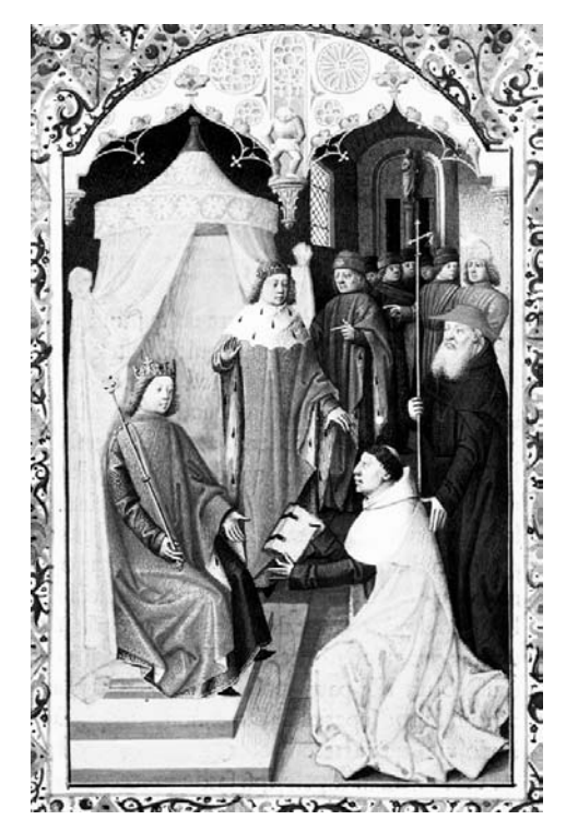
Fig. 11.3. The title page of Bessarion's anti-Turkish tractate (Bessarion, "Orationes et epistolae ad Christianos princes contra Turcos"). In Latin. Taken from [1374], page 64.

brave hero of the "antiquity" and entered history textbooks as such.