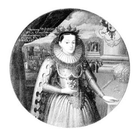
Fig. 9.5. Old portrait of Marina Mniszek. Dates from the early XVII century, or supposed to have been painted during her lifetime. Taken from [234].

This very child had been murdered by the Romanovs afterwards - hanged upon the Spasskiye Gate, the objective being the removal of an unnecessary obstacle from their way to the throne.