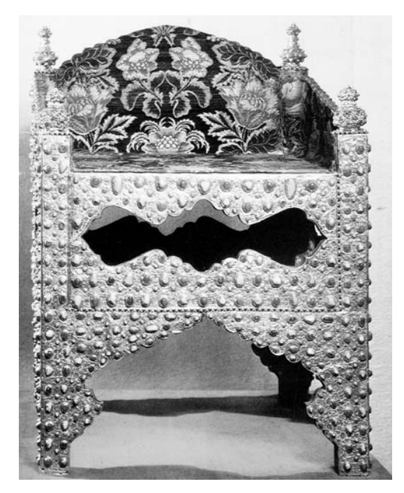
Fig. 9.3. The "oriental throne" of Boris Godunov. End of the XVI century. Appears to reflect the style and the atmosphere of the Russian court of the Horde quite well. Taken from [550], page 101.