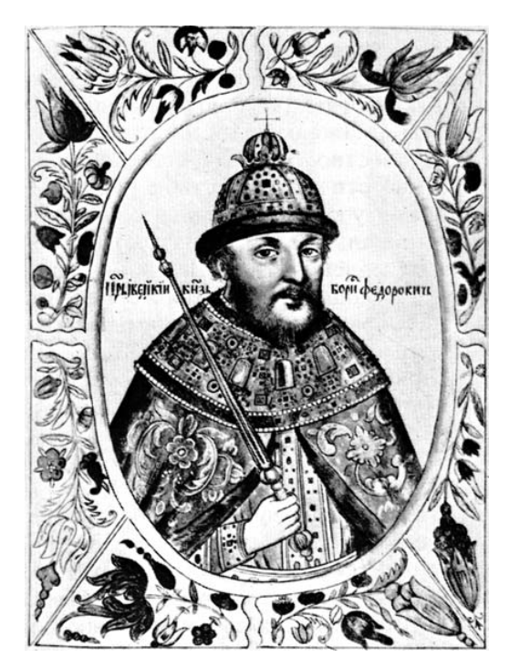
Fig. 9.1. Czar, or Khan, Boris "Godunov". Miniature taken from the "Titular Book" of 1672. Taken from [550], page 101.

be seen in [759], where it is referred to as "the epistle of the Crimean Khan to the Muscovite boyar Boris Godunov". However, there are marks from the royal chancellery on the letter, wherein they were registered. These marks tell us something entirely different. Let us quote: