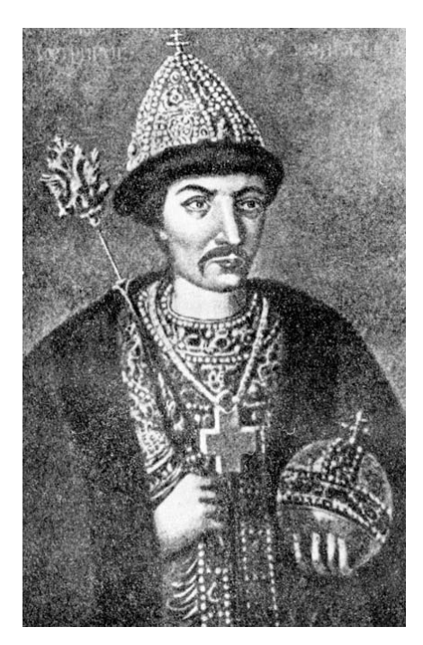
Fig. 9.4. Portrait of the Great Czar, or Khan, Boris "Godunov" dating from the XVII century. Godunov looks like a Tartar owing to the efforts of the Romanovs. Taken from [777], inset between pages 64 and 65. See also [578], Book 2, page 695.

"The Russian historical reports that render the biography of the young Prince Dimitriy remain thoroughly enigmatic to date. He is known to us as "The