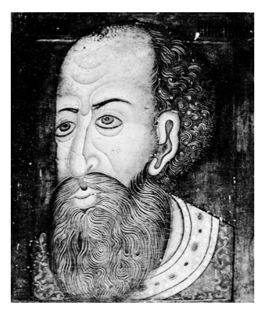
Fig. 8.2. The icon that portrays Ivan IV (St. Basil?) Kept in the National Museum of Copenhagen. Taken from [780], colour inset after page 64.

The fact that Ivan IV, the conqueror of Kazan, can be identified as St. Basil the Blessed is indirectly confirmed by the fact that the famous Pokrovskiy Cathedral on the Red Square in Moscow, which was built to commemorate this conquest, is still known as the Cathedral of St. Basil the Blessed.