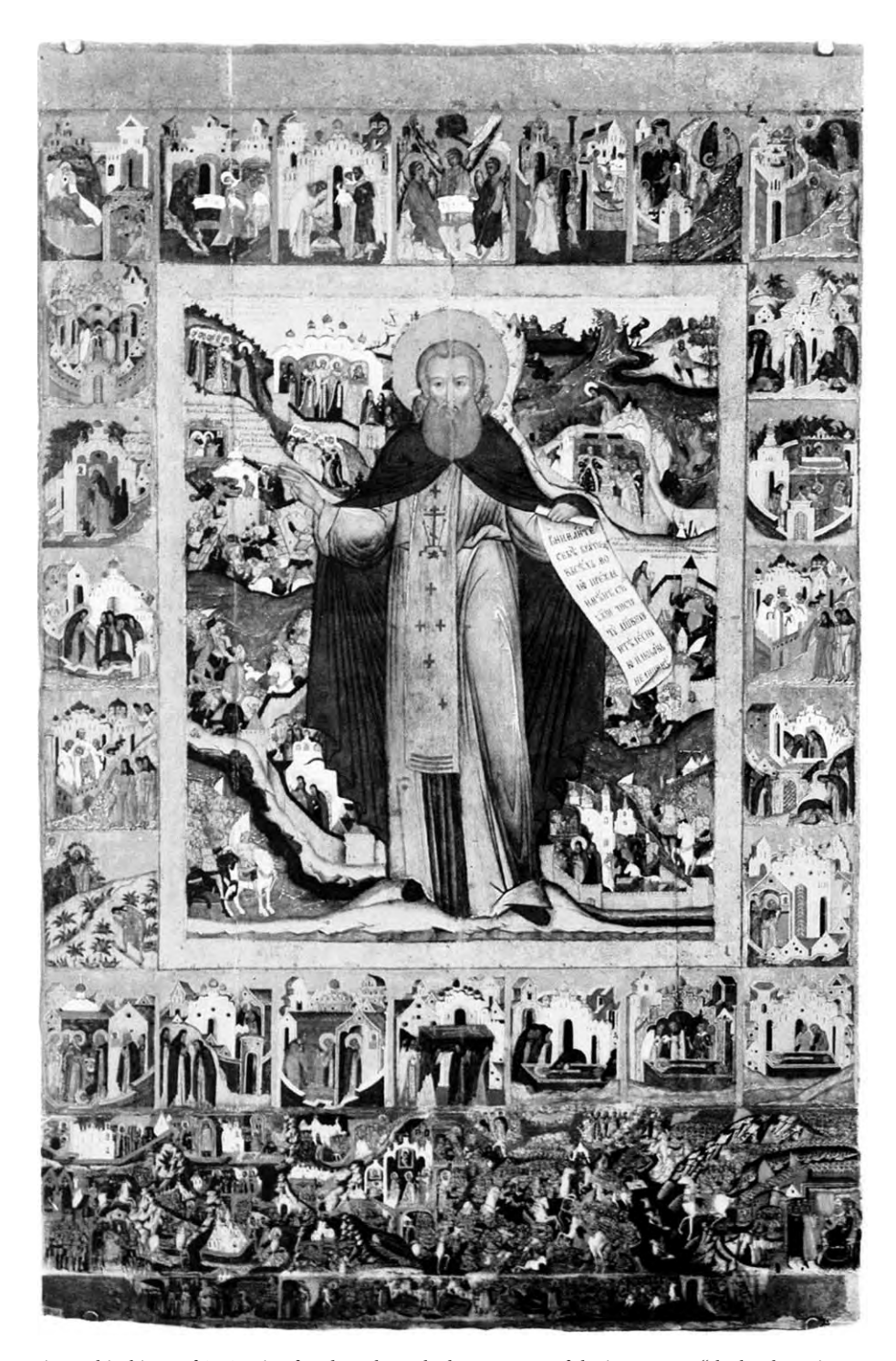
Fig. 6.64. Hagiographical icon of St. Sergiy of Radonezh. In the bottom part of the icon we see "the battle against Mamai". Taken from [142], page 130.