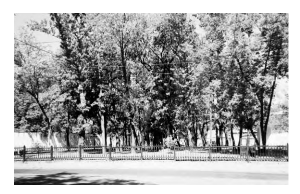
Fig. 6.58. The square on the site of the monastery's old necropolis. Photograph taken in 2000.

the Lord for victory. The bodies of many heroes that fell in this battle are buried in the churchyard of the monastery" ([569], page 1). This fact is also mentioned in [556]. "The oldest necropolis in Moscow, which is of great historical significance, had remained within the confines of the friary for a long time. It is known that Most Reverend Sergiy of Radonezh had visited the monastery on the night before the battle ... He blessed the army for victory. The heroes of the great battle, who have fallen for the Motherland, were buried in the Spaso-Andronikov Monastery with great solemnity; ever since that day, this churchyard has served as the last resting place of the soldiers who fell defending their country" ([556]).