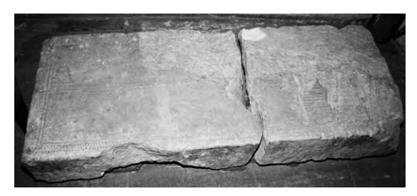
Fig. 6.62. Another XVI century headstone from the necropolis of the Spaso-Andronikov Monastery exhibited in its museum. We also see the ancient forked cross; there had once been some lettering in the top part, but it was chiselled off – the remaining fragments don't let us reconstruct a single word. Photograph taken in 2000.