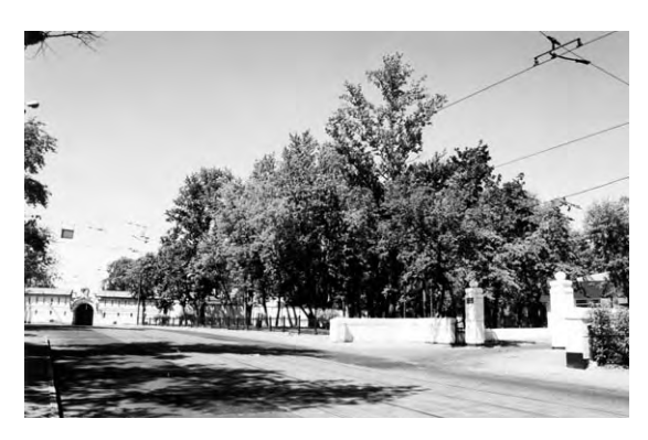
Fig. 6.57. The general view of the Spaso-Andronikov Monastery's old necropolis, which isn't on the premises of the monastery anymore. In the background we see the monastery's wall, which was rebuilt in the XX century. The warriors buried on the Kulikovo Field were buried on this cemetery. Photograph taken in 2000.