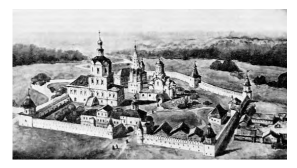
Fig. 6.55. General view of the Andronikov Monastery in the XVIII century. Watercolour by Camporesi. Taken from [100], page 132.