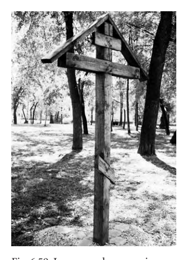
Fig. 6.59. Large wooden cross, installed in memory of the warriors who had been killed in the Battle of Kulikovo and buried in the old cemetery of the Spaso-Andronikov Monastery. This information was related to us by the monastery museum workers. Photograph taken in 2000.