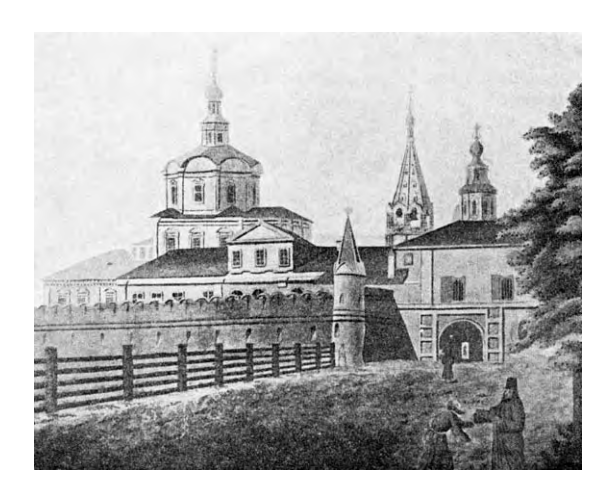
Fig. 6.54. Andronyev (or Andronikov) Monastery in the XVIII century. Taken from [568], page 71.