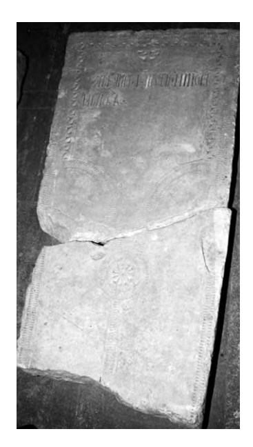
Fig. 6.63. Top parts of the XVI century headstones with lettering from the museum of the Spaso-Andronikov Monastery. Photograph taken in 2000.

Fig. 6.61. A XVI century headstone from the necropolis of the Spaso-Andronikov Monastery. Currently kept in the museum of the Spaso-Andronikov Monastery in Moscow. We see an old forked three-point cross on the stone this is how the Russian headstones had looked before the XVII century. However, the inscription was renewed - it may be a copy of the obliterated initial lettering, but this isn't quite clear. Photograph taken in 2000.