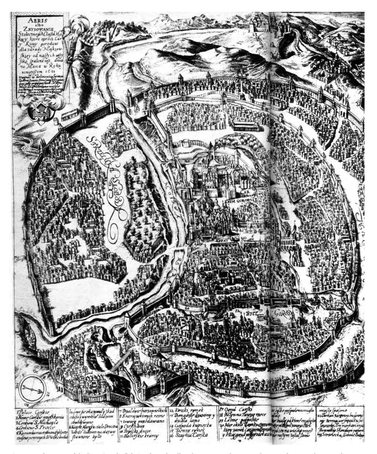
Fig. 6.91. A fragment of the "Nesviga plan" dating from the alleged year 1611, whereupon the part of Moscow between the Kremlin and the Yaouza estuary, or the Kulishki, is already filled with buildings. Thus, the plan in question cannot predate 1768. Taken from [627], page 59.