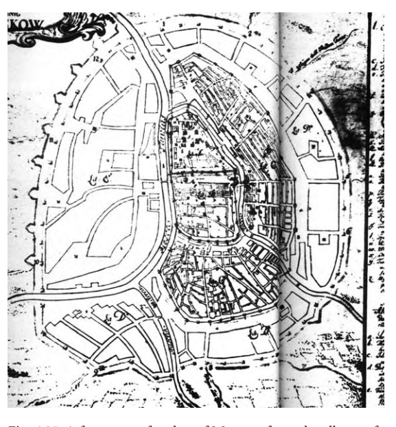
Fig. 6.95. A fragment of a plan of Moscow from the album of E. Palmquist, allegedly dating from 1674. We see buildings all across Kulishki, or the area between the Kremlin and the estuary of River Yaouza. Therefore, the plan couldn't have been drawn before 1768. Taken from [627], page 81.