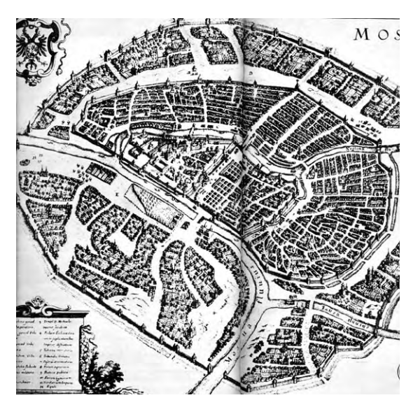
Fig. 6.92. A fragment of the map of Moscow engraved by M. Merian in the alleged year 1638, whereupon the part of Moscow between the Kremlin and the Yaouza estuary, or the Kulishki, is already filled with buildings. Thus, the plan in question cannot predate 1768. Taken from [627], page 75.