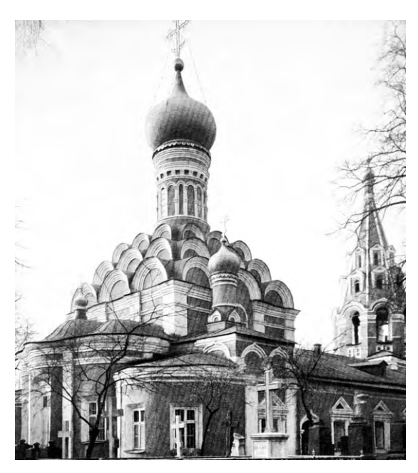
Fig. 6.83. The Lesser (Old) Cathedral of the Donskoi Monastery in Moscow. Taken from [31].

The large cathedral of the Donskoi monastery was erected in 1686-1698, qv in fig. 6.85 – at the very end of the XVII century, that is, and already under the Romanovs. One must think that the new decoration of the cathedral was already reflecting their "progressive" view of the Russian history. It is therefore futile to search for traces of the ancient history of Russia (aka the Horde) in that cathedral – also, it turns out that "the cathedral has undergone many restorations and renovations" ([31], 21). The XVII century can be