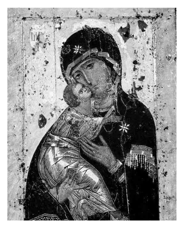
Fig. 6.86. The icon of Our Lady of Vladimir. Taken from [969], ill. 1.

It is most curious that the part of Moscow where we suggest the Battle of Kulikovo to have been fought (the Kulishki) is drawn full of buildings in the plan of Isaac Massa. This is very odd, since this entire region is drawn as void of buildings and constructions in the two substantially more recent maps dating from 1767 and 1768 (figs. 6.53 and 6.87, respectively