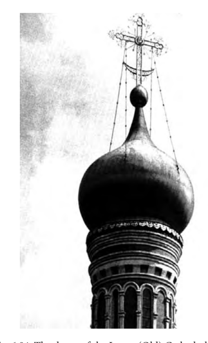
Fig. 6.84. The dome of the Lesser (Old) Cathedral of the Donskoi Monastery in Moscow. We see it topped with a symbol typical for the Russian churches - a Christian cross that comprises the Ottoman crescent and the star. Taken from [31].