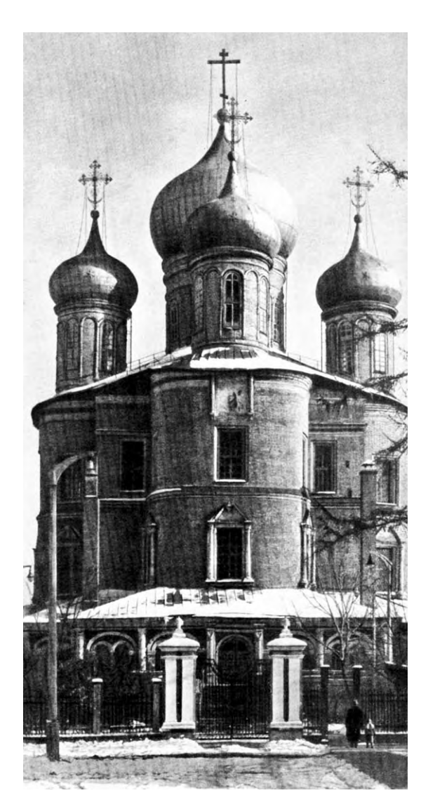
Fig. 6.85. The Greater Cathedral of the Donskoi Monastery in Moscow. Upon its domes we see the same kind of Orthodox crosses comprising the Ottoman crescent and the star. Taken from [31].

regarded as the credibility threshold of consensual world history, and we see it manifest in the history of the Donskoi monastery as well.