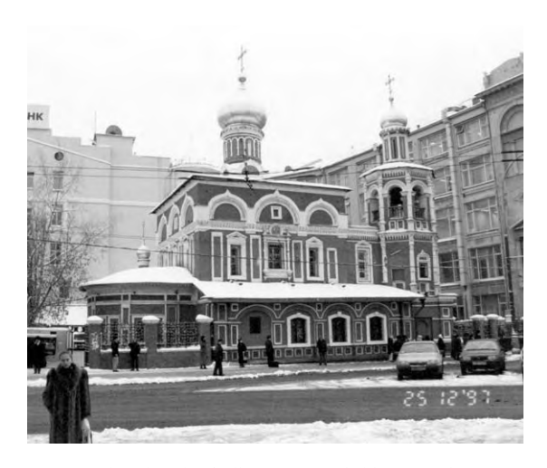
Fig. 6.2. The Church of All Saints at Kulishki. According to our reconstruction, the troops of Dmitriy Donskoi had stood here before the Battle of Kulikovo. Photograph taken in 1995.