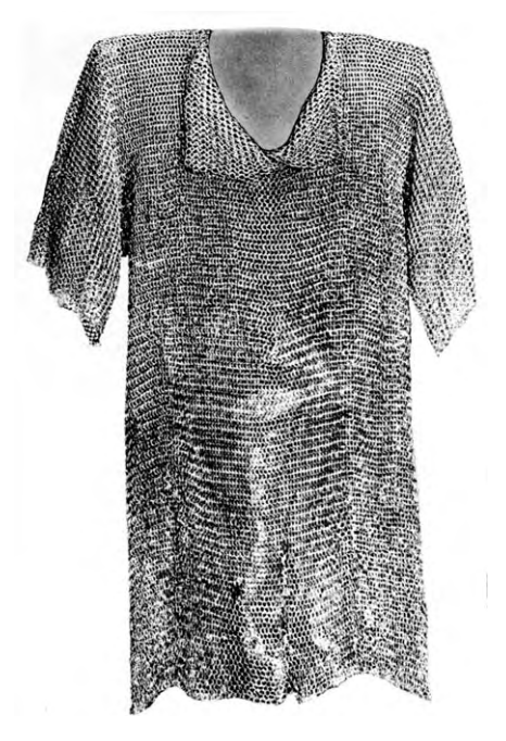
Fig. 6.1. Chain mail allegedly found upon the Kulikovo Field in the Tulskaya Oblast. Historians are trying to convince us that this chain mail is some six hundred years old, which is highly doubtful – six hundred years underground would have transformed it into a solid mass of rusty metal with its original shape well beyond reconstruction. Taken from [974].

arrowheads were found near the village of Khvorostyanka, one of them from an armour-piercing arrow, and several belt strands, which used to be a standard ammunition item. The excavations carry on".