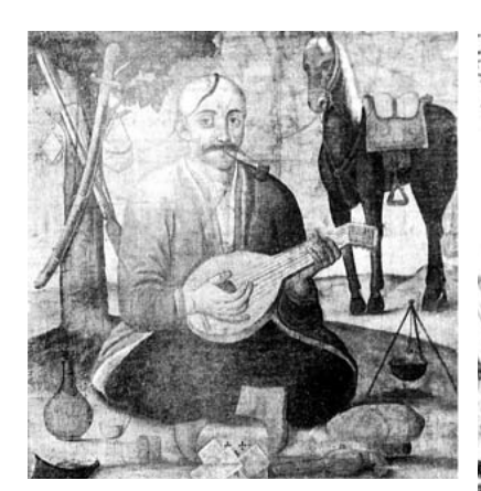
Fig. 3.19. Old picture entitled "Mamai the Cossack Having a Rest" ([169], inset between pages 240 and 241). We see that the name Mamay had been popular among the Zaporozhye Cossacks. Taken from [169], inset between pages 240 and 241.

One must also mention N. A. Baskakov's book entitled Russian Names of Turkic Origin ([53]), which demonstrates many of the Russian first names and