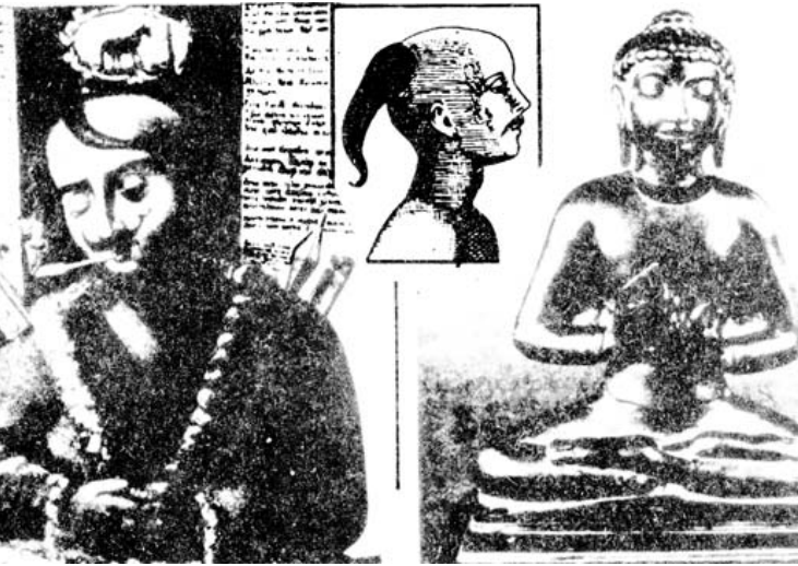
Fig. 3.20. The respective hairstyles of the Ukrainian Cossack Mamai (left) and Buddha (right).