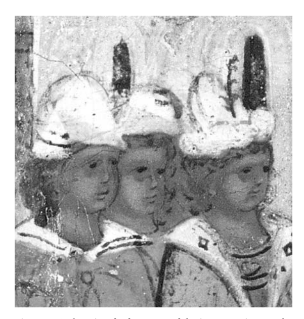
Fig. 3.13. A close-in of a fragment of the icon. Russian youths in turbans. Taken from [48], illustration 239.

must have forgotten about them (or made forget after the Romanovian reforms), unlike the Eastern countries. One must point out that the Russian word for turban is chalma, and it derives from the Russian word chelo ("forehead") - a very logical name for a headdress item.