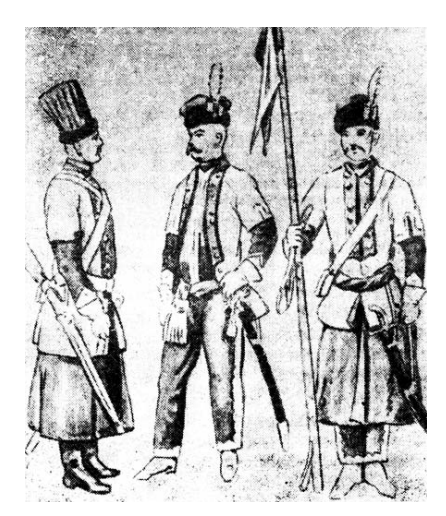
Fig. 3.15. "Warriors from a Tartar regiment in the epoch of Stanislaus Augustus (late XVIII century)". Taken from [206], page 39.