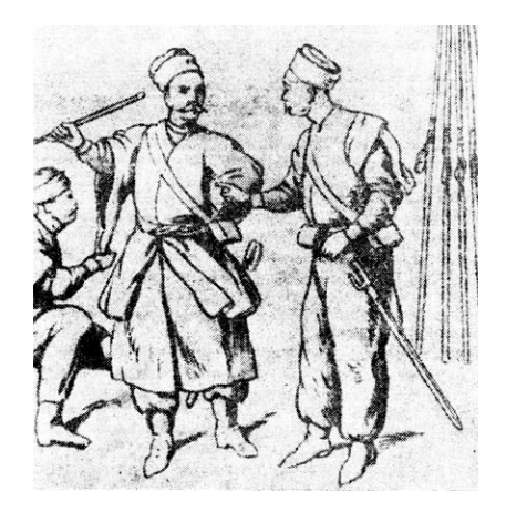
Fig. 3.14. "Warriors from a Tartar regiment in the first half of the XVIII century". Taken from [206], page 35.