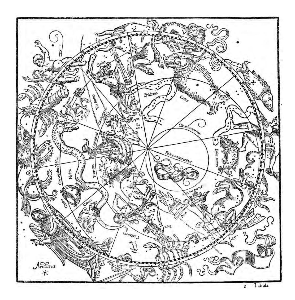
Fig. 2.6. Star chart of the Southern Hemisphere from a 1551 edition of the Almagest. The constellation of Orion, for instance, looks like a mediaeval knight. Taken from [543], inset between pages 216 and 217.