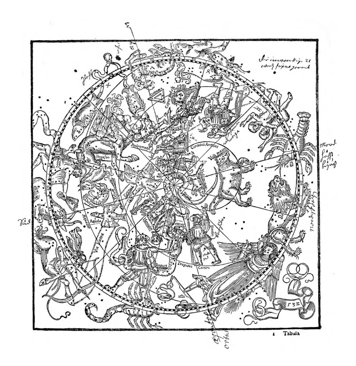
Fig. 2.5. Star chart of the Northern Hemisphere from a 1551 edition of the Almagest. Some of the constellation figures are wearing mediaeval clothes, no less. Taken from [543], inset between pages 216 and 217.