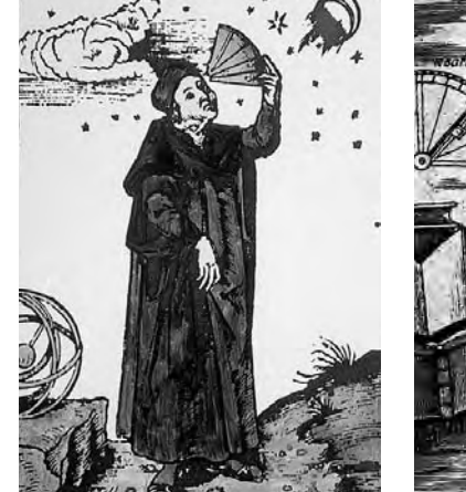
Fig. 0.5. Ancient portrait of Ptolemy. Wood engraving, XVI century. Taken from [1160], page 25.

It has to be pointed out that certain researchers consider the existing division of the Almagest into chapters to be more recent than the book itself, likewise the names of the chapters ([1358], pages 4-5). However, this fact is of no importance to us presently, since our only goal is to familiarise the readers with the structure of the Almagest.