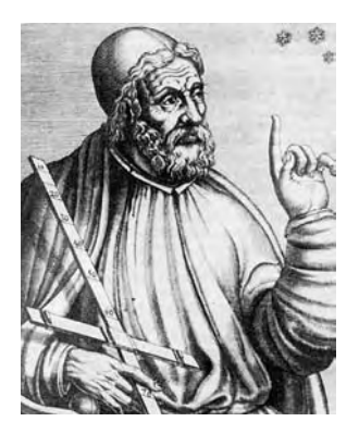
Fig. 0.1. Ancient drawing of Ptolemy dating from 1584. Ptolemy is holding a Jacob's rod. Thevet. Les vrais protr. et vies d'hommes illustres... Paris, 1584. Taken from [704], page 431.