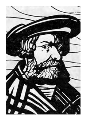
Fig. 0.4. Ancient portrait of Ptolemy, where he looks like a typical mediaeval European. Taken from [98], page 7.

quite alien to the polytheism of the Olympians. And yet Scaligerian chronology tries to convince us that Christianity only became the official religion in the IV century A.D., and the "ancient Greek Ptolemy" from the II century A.D. is clearly considered a pre-Christian author by the historical authorities.