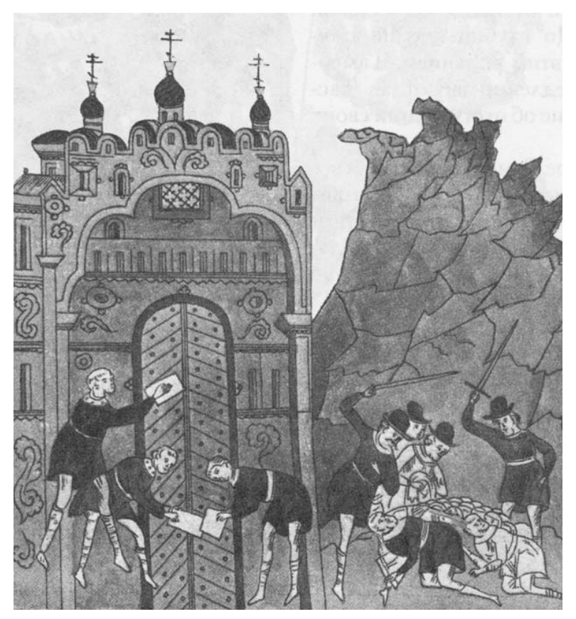
Fig. 3.9 Mediaeval illustration entitled "The Turks Massacre the Christians and Seal up the Temples of Our Lord". Taken from "The Hagiography of St. Alexiy, the Muscovite Metropolitan, written by Pakhomiy Lagofet in the XVI century" ([578], Book 2, page 16). The mediaeval Ottomans look perfectly European here – wearing urban clothing from the Middle Ages, with broad-brimmed hats on their heads, and armed with straight-edged swords instead of scimitars.