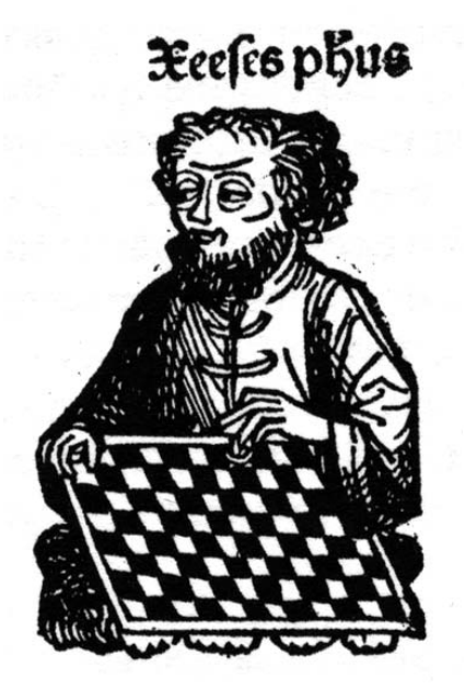
Fig. 3.4 An ancient picture of king Xerxes from Hartmann Schedel's Liber Chronicarum , dating to the alleged year 1497. A propos, Xerxes is portrayed holding a chessboard. Taken from [90], page 27.