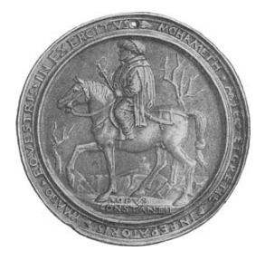
Fig. 3.7 Medal portraying Mohammed II, reverse. Original kept in the Royal Münzkabinet, Berlin ([304], Volume 2, pages 516-517, inset.