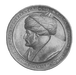
Fig. 3.6 Large medal portraying Mohammed II, conqueror of Constantinople. Front side. Taken from [304], Volume 2, pages 516-517, inset.